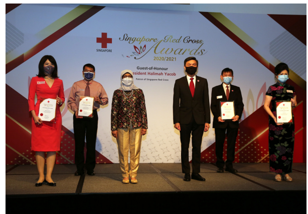
Above: A glimpse of the award ceremony in Singapore.

The prestigious awards recognize and honor the contributions of volunteers and partners who have given selflessly of their time, each contributing expertise and resources in their own ways to further SRC's mission; and whose support over the past two years gave help and hope to communities-in-need.