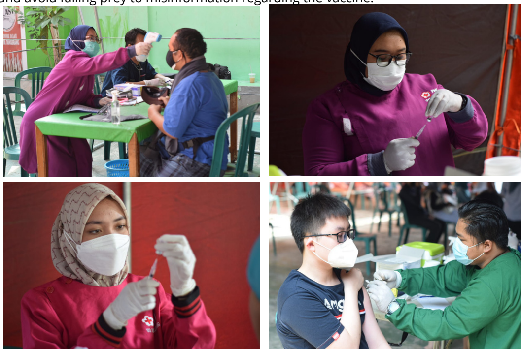
Above: PMI volunteers providing COVID-19 vaccinations.

Meanwhile the Red Cross continues its effort to ensure that no one is left behind in getting COVID-19 vaccination by raising awareness through online and offline mechanisms on the importance of following all health and hygiene protocols and avoid falling prey to misinformation regarding the vaccine.