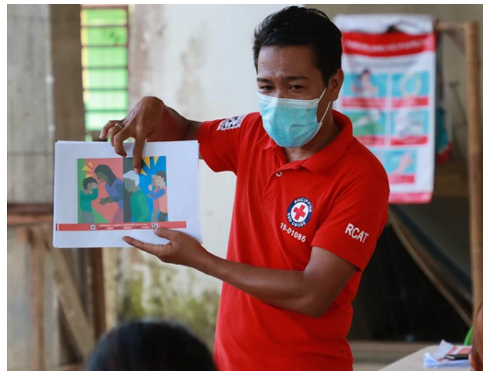
Above: Volunteers of the Philippine Red Cross discussing about SGBV in the community .