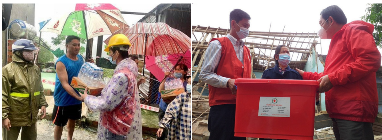
Above: The Viet Nam Red Cross distributing relief kits to flood affected people.

The Vietnam Red Cross immediately swung into action providing relief to people in the provinces of Phu Yen and Binh Dinh with cash assistance and distribution of relief kits with food, water, cooking utensils, blankets and water containers. 200 kits were distributed in each province.