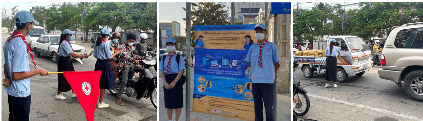
Above: CRC youth volunteers conducting road safety awareness.

Cambodian Red Cross youth and volunteers have been at the forefront of promoting behavior change in their communities regarding road safety. As part of a campaign to save lives and prevent injuries, the youth and volunteers have held public forums, awareness sessions among drivers on arterial roads and peer to peer education in schools and communities. The issues covered in these sessions include: driving safely, upholding traffic law, using helmets, respecting road traffic signs, dangers of drunk driving and offering right-of-way to pedestrians and other drivers.