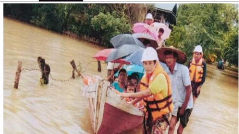
Minbya, Aug 2019: MRCSS activities strengthened community-level actions to prepare for & respond to disasters in Rakhine.

“ We have been closely watching the Bay of Bengal as the Tropical Cyclone Amphan continues to progress in close proximity to Myanmar. MRCSS has extensive experience dealing with various natural disasters including tropical cyclones. We have prepared the communities for disasters over the years and have more than 1,827 Emergency Response Team (ERT) trained Red Cross volunteers ready for response throughout the country. This year, the communities face double threat of COVID-19 and cyclone. We are mobilizing our volunteers to disseminate early warning and early action key messages. We also take necessary readiness measures in the communities, including the pre-positioning of stocks, to prepare and reduce potential risk of the Tropical Cyclone under COVID-19. ” San San Maw, Director of Disaster Management Department, MRCSS