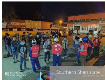
Southern Shan state

11,209+ activities in 291 townships organizing physically distancing awareness raising sessions and disseminating preventive information