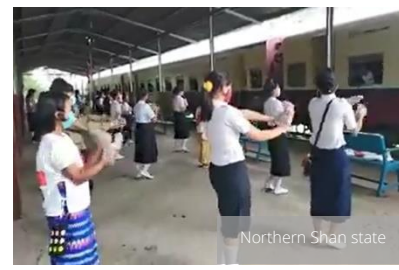
Northern Shan state