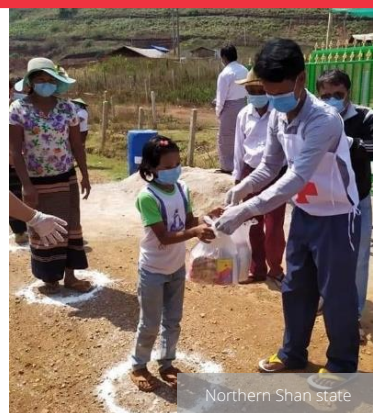
Northern Shan state