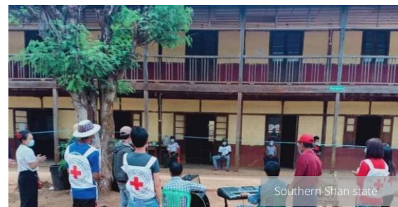
Southern Shan state