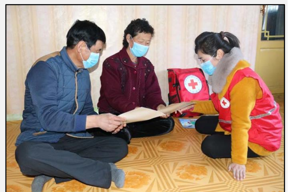
DPRK RCS volunteer delivering key preventive messages against COVID-2019 to the elderly people in Inpyong-ri, Sinyang county, South Phyongan province.