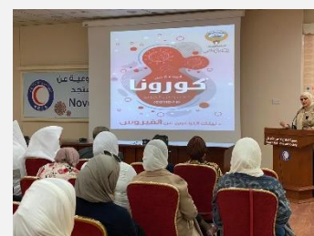
Awareness session on COVID-19.

In coordination with the MoH, KRCS supported the clinics and health centres with volunteers and distributed them to support the health system in the country. Additionally, KRCS supported in the isolation locations identified by the MoH and distributed the basics needs for the isolated peoples in terms of food and other needs and after they finished the isolation period, they supported in the supervising the transportation of the isolated cases along with the MoI. KRCS also, conducted awareness session in coordination with the MoH for the health workers and the those who works closely with the cases.