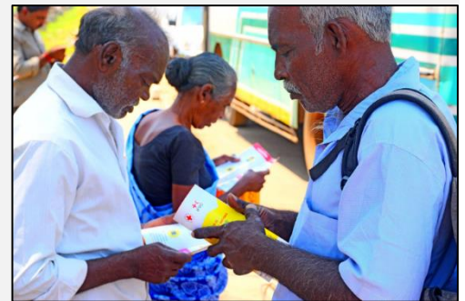
Reading IEC material distributed by the SLRCS.

According to the Epidemiology Unit and Health Promotion Bureau of Sri Lanka (17 March), there has been a total of 29 confirmed cases and 204 individuals remain under observation. The confirmed cases are treated at the Infectious Diseases Hospital (IDH) hospital in Angoda, Colombo. SLRCS has maintained national and district-level coordination with health and non-health sectors for wider awareness, and has supported hospitals with the provision of water tanks.