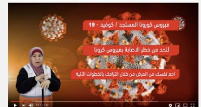
COVID-19 video with Sign language

PRCS Lebanon branch has made coordination meetings with the movement partners including Lebanese RC on close collaboration as well as the Embassy of Palestine in Lebanon, UNRWA and other organization working for Palestine communities in Lebanon. 433 Palestine and Syrian refugees in Lebanon (344 female, 89 male) are reached by PRCS/L hygiene promotion and awareness related to COVID-19. PRCS Gaza and Syria branches hold COVID-19 awareness raising workshop for local communities.