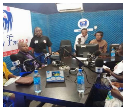
Nigerian Red Cross Society mass awareness actions in collaboration with Family FM radio station.

Nigerian Red Cross Society is in its peak of intervention with support from the Global Appeal. Mass awareness activities is on-going in the states of Lagos and Ogun. The channels for feedback mechanisms include WhatsApp, Toll-free lines, FGDs, social media is activated and have received 277 feedbacks as of 17 March 2020. The nature of feedback collected so far are on false information about COVID-19, misconceptions, and RC gratitude. Volunteers observations show that people continue to shake hands, are not observing social distance, eating without washing their hands at the market, and the stigmatization of Asians is continuing. This indicates the need for further risk communication activities. Three radio shows (out of 4) have been completed in the two states, 3 jingles produced by the NS and approved by the Nigerian Centre for Disease Control (English, Pidgin & Yoruba) was aired 32 times.