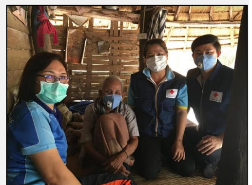
Mask distribution to homes and vulnerable groups in Thailand.

King Chulalongkorn Memorial Hospital (KCMH), under TRCS, is one of the hospitals in Thailand that can test and diagnose COVID-19 in patients. During the period from 1 Feb - 16 Mar, a total of 3,262 people has been screened at KCMH for COVID-19, and 1,546 people were transferred to Emerging Infectious Diseases (EID) clinic for further treatment. Of these, 257 patients are under investigation. Currently, there has been 19 confirmed cases of COVID-19.