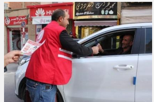
ARCS awareness session on COVID-19

At the moment, 2,695 staff, 7,728 volunteers and 1,195 trainers have been trained through online course. More than 5 million people have passed the online course on coronavirus. 100 volunteers are involved MHPSS, mass media and social media are being utilized for public awareness. 35 million have visited the info graphic. The most hazardous areas in Tehran city is planned to be disinfected by IRCS's volunteers. The fever screening is continuing at 471 screening posts and 449,676 people are screened and 3,477 people with high fever are referred to EMT affiliated to the Iranian Ministry of Health such as the entrance of cities, bus terminals, airports, railway stations. The sanitizing items are still being distributed among 25,000 vulnerable families in some districts of Tehran. The programs are accessible through virtual networks and also Dial- A – Story service at No. 021 6427 to cite stories with humanitarian themes for kits and children aged 4- 12 during home quarantine. Clinical care management, Noor Afshar Hospital receives suspected cases with capacity of 100 beds. 40 cases have already been hospitalized.