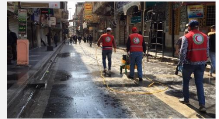
IRCS support in spraying to disinfect areas

1,000 staff and volunteers are trained on COVID-19 in 13 Governorates (Erbil, Sulimaniah, Kirkuk, Diyala, Baghdad, Anbar, Wasit, Babil, Najaf, Kerbalaa, Muthana, Misan, Thiqr and Basrah) in Iraq. 1,645,547 people (64,5447 beneficiaries from awareness campaigns, more than 1 million beneficiaries have been reached by Iraqi Red Crescent Society media awareness video, brochures and publication, sterilized institutions and places. For coordination, Iraqi Red Crescent Society is a member of the Crisis Management Cell in the Iraqi state.