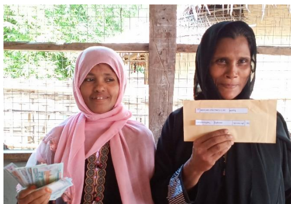
Beneficiaries after receiving cash payments