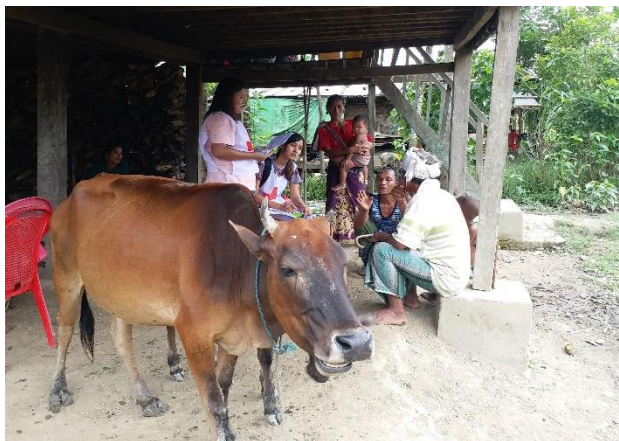
Livestock sector beneficiary household