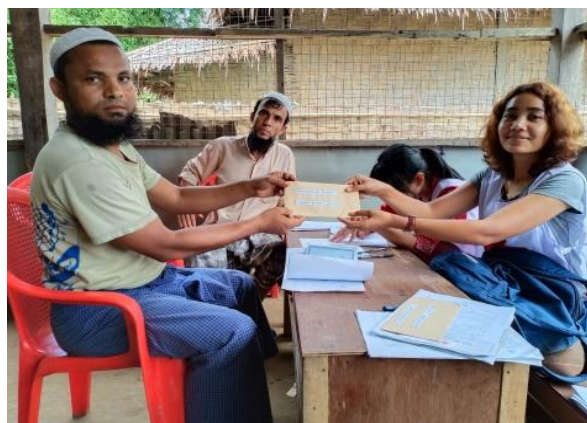
Beneficiary receiving cash in envelope

A total of 512 beneficiaries (Male 76%, Female 24%) benefited through the cash assistance for livelihoods recovery. The targeted beneficiaries have undergone orientation on livelihoods recovery and business plan development process. The livelihoods cash grants supported sector activities as follows: Agriculture– 5%, Livestock 2 – 76%, Small Business– 10% and Fishery– 9%.