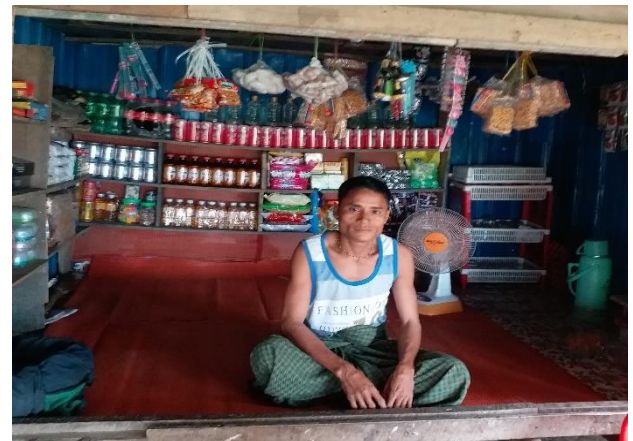
Small shop business beneficiary