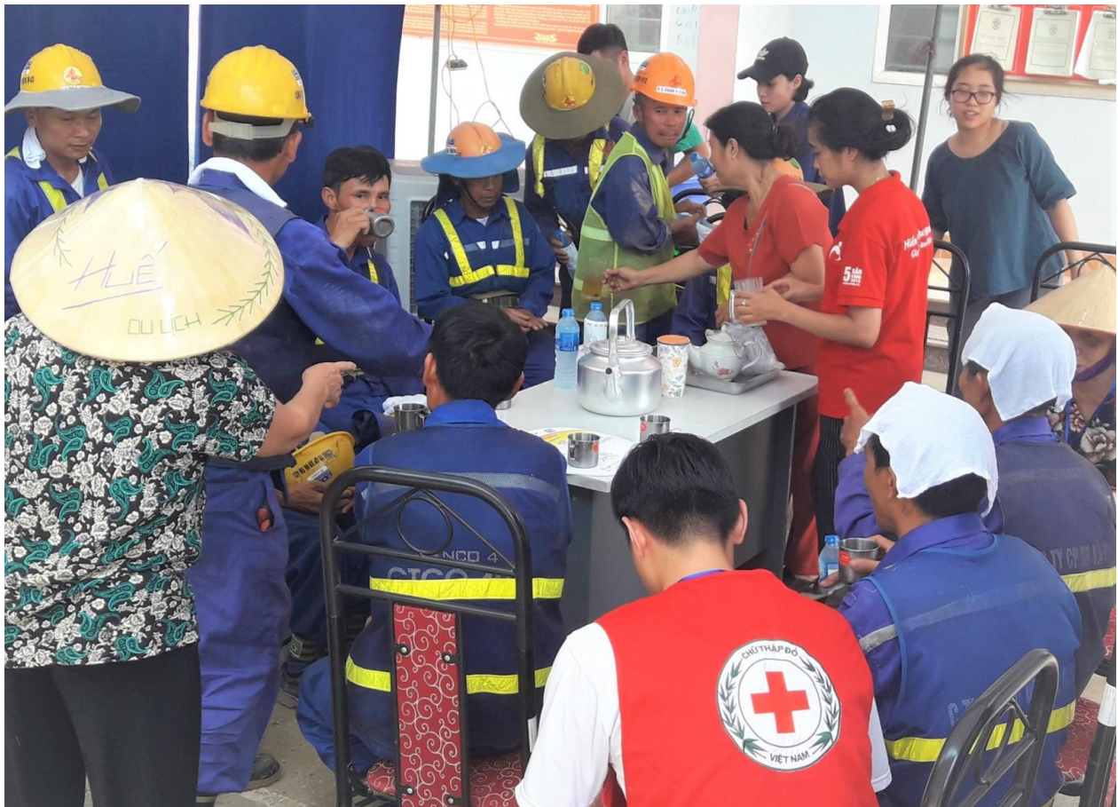
Builders take much-needed rest in a Red Cross Cooling Centre to recover from long hours working under the sun.