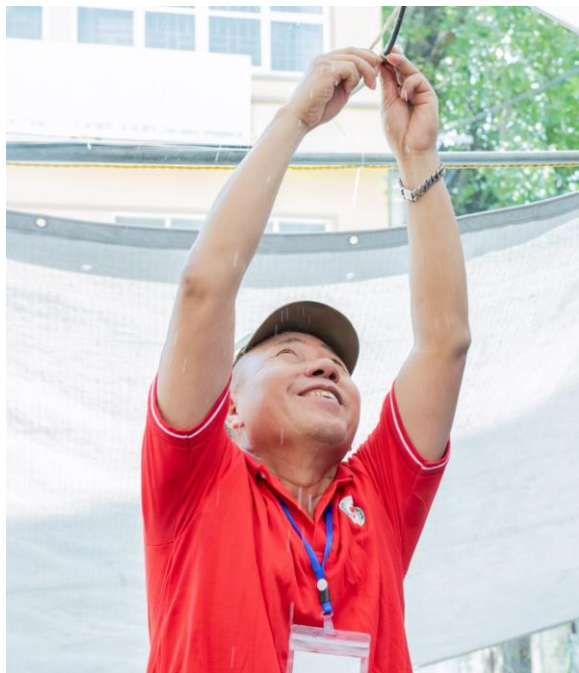
Local volunteer fixes the water sprinkler system for cooling the Red Cross community centre

In total in 4 days the two centres received 479 visits . 211 persons stayed about 10 minutes in average in the centres, and 19% came more than once. 26% of the visitors were for-hire-daily-workers, 23% builders, 14% bikers/shippers and 9,5% street vendors. The main reason of their visit was to drink water (93%), to have a rest in a cool place (45.5%), and to receive advice about how to better cope with heat (20%). The visitors showed the same heat related symptoms than the ones observed in the KAP surveys: thirsty, excessive sweating, feeling hot / increased temperature, feeling weak/tired. After their visit to the cooling centre, 66.8% declared that they felt better or really better , and as a result 90% recommend to re-open the centres when a heatwave will be forecasted. Thus, the cooling centres reached the targeted groups and were socially well accepted by the local population and authorities. The test has been showcased on local and National TV , Facebook page and in Newspapers as an innovative and relevant initiative. Scaling up in 15 wards will further contribute to confirm the positive impacts of this Early Action and should provide information on the effectiveness of the action in reducing the occurrence of heat related symptoms.