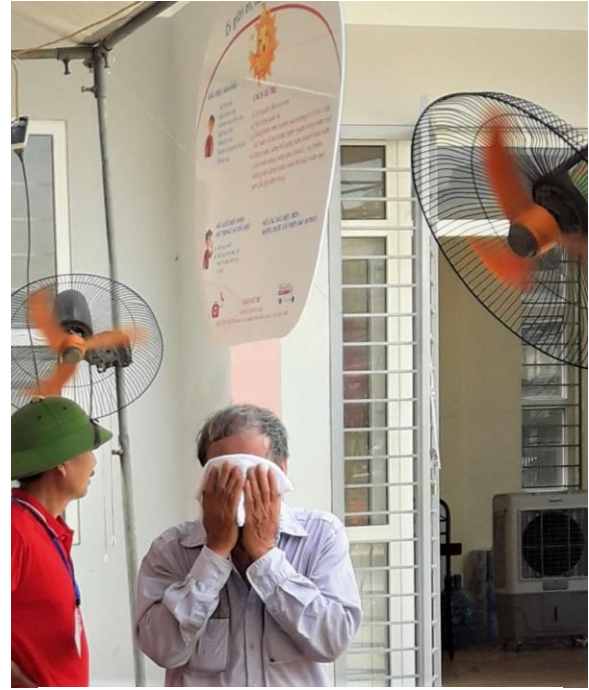
Local biker in a Red Cross cooling Centre refreshes his face to recover from heat exposure

Heat waves are a significant public health hazard in Vietnam, particularly for vulnerable population groups such as elderly and low-income group working in outdoor jobs. Heatwave event is associated with a 20.0% increase in hospital admissions for all causes and 45.9% for respiratory diseases. The results of KAP surveys conducted by the project team show that 66% of the persons from vulnerable groups (elderly, slum dwellers, builders, shippers, street vendors) have experienced four to six symptoms of heat exhaustion during heatwaves. Thus, the aim of the Early Actions is to reduce the occurrence of heat related symptoms in the targeted population by providing cool shading places during day-time to people earning their living in the streets and by improving sleeping conditions of people living in slums and poor habitations. Indeed, having regular rests in cooler environment is a very efficient way to avoid the body temperature to increase, and therefore to prevent from potentially dangerous effects of heat exposures such as a heatstroke.