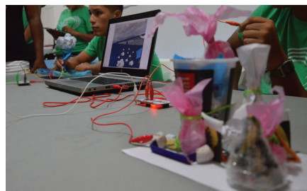
Youth as artists and makers