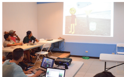
Artist as facilitator focusing on the incorporation of digital tools