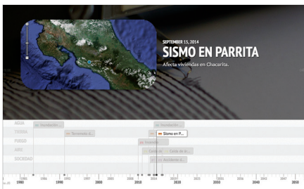
Digital maps, timelines, simulations, data analysis, and more