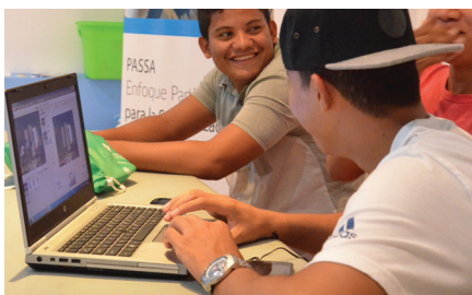
Incorporation of digital tools