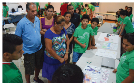
Artist as youth mentor while playing a vital role in the documentation of PASSA