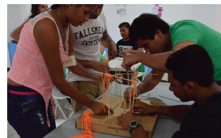
Enrichment of activities