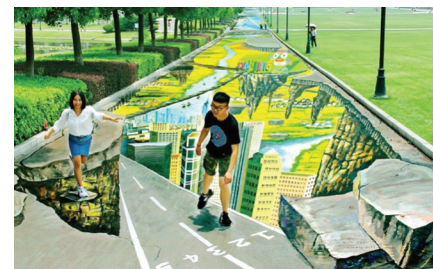
Youth programming their own interactive content and spaces