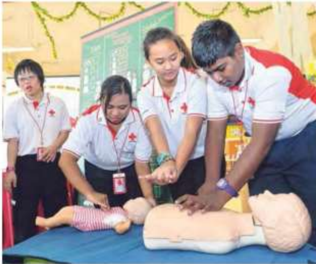
The new club will comprise students from the APSN Delta Senior School, who have mild intellectual disability, and allow them to work with other Red Cross Youth members.

"But at the end of the day, they were really friendly and they made me realise that we are just the same people," said the 19-year-old.