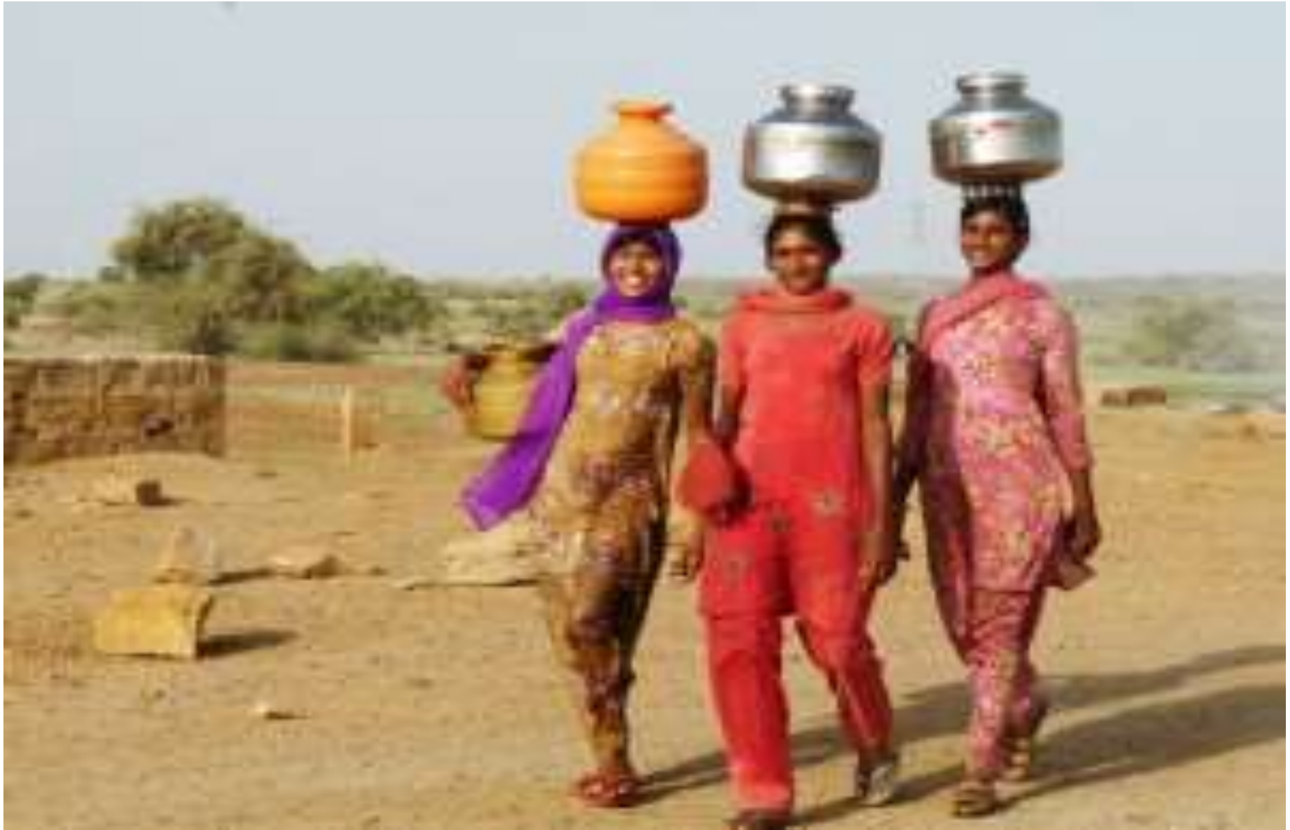
UN Meeting, 29th & 30th, Bangkok, Thailand