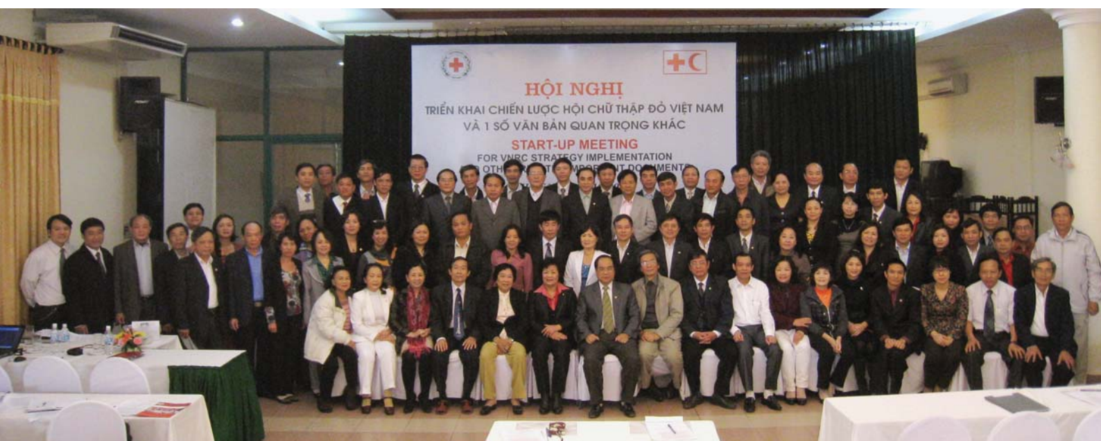
LEADERS FROM PROVINCES AND DEPARTMENTS OF HEADQUARTERS (At start-up workshop for the implementation of Viet Nam Red Cross Strategy 2020)