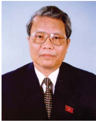
HONORARY PRESIDENT Former President of the Socialist Republic of Vietnam Tran Duc Luong