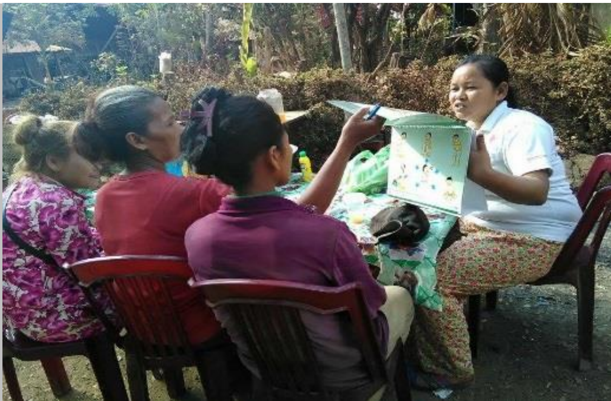
Cambodian Red Cross volunteer conducting awareness raising activity on hygiene promotion at Kratie Province in Cambodia

Peer-to-peer learning is one of the key approaches for regional cooperation in Southeast Asia Red Cross Red Crescent Societies, which consist of: