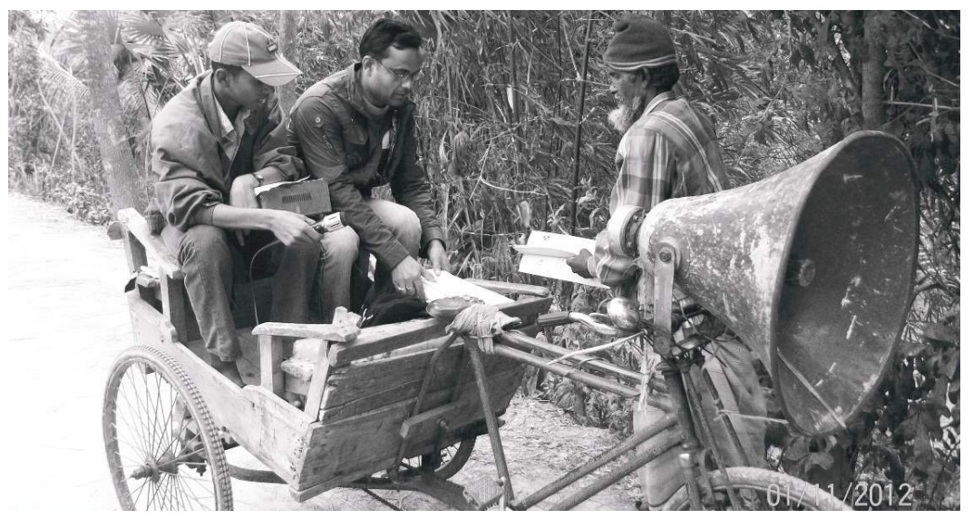
Announcing the next village meeting

The following two good practices evolved through the CMDRR pilot project: