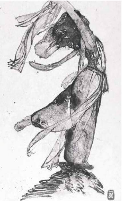
"She Dances on the Wind" - Ona Henderson (one of the images used for the gender and disaster project)