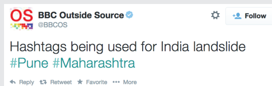
Figure 3: Example BBCOS disaster title hashtag 53

It is difficult to follow a conversation when people are discussing the same event but referencing it differently. Disaster title hashtag standardization is less about specific disaster names and more about establishing a structure early during an event to ensure continuity in information feeds.