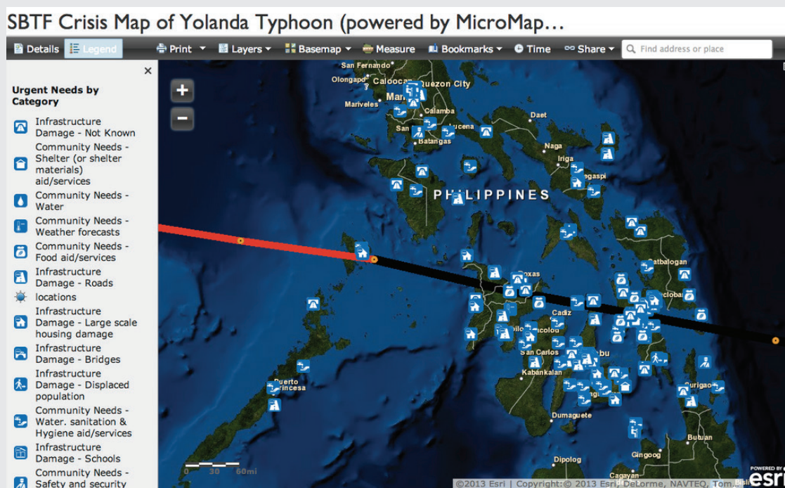
Figure 5: Crowdsourced crisis map used to facilitate humanitarian logistics in the Philippines (2013) 55

Militaries view each soldier as a sensor. This same idea of valuing the eyes, ears and opinions of community members can be used to support humanitarian response. 1 Public reporting hashtags will allow emergency response agencies to collect non-emergency information, such as broken power lines, road closures, destroyed bridges, large-scale housing damage, population displacement or geographic spread (e.g., fire or flood). Currently, many tweets are sent with non-emergency planning in mind. However, this information can be quickly transformed to build maps of the environmental context where agencies and the affected communities are working. Emergency agencies can engage the public in relief efforts and improve logistical capacity by encouraging a public reporting hashtag, such as #iSee, #iReport, #PublicRep or #311US (culturally referenced hashtag, discussed below), while also educating the public on its use. When the public reports damages or requests through a GPS-enabled tweet, the