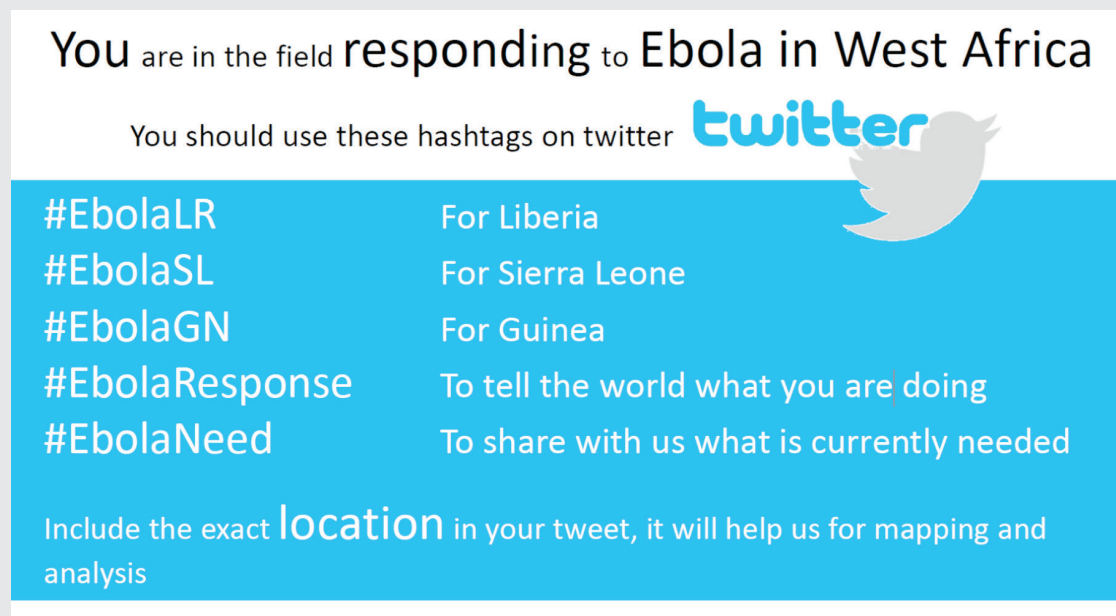
Figure 8: Integrated Ebola example (disaster name hashtag, public reporting hashtag, infographic and GPS)

Humanitarian IMO (@hum_IM) is a Twitter account that connects OCHA information management officers. It recently integrated the above-mentioned ideas to support the West Africa Ebola response (figure 8) 60 . #EbolaLR, #EbolaSL and #EbolaGN are examples of disaster-naming hashtag standards. #EbolaResponse and #EbolaNeed are examples of public reporting hashtag standards. The dissemination of this information is integrated into an infographic for easy sharing and to prevent the disruption of hashtag monitoring. The publication encourages the geo-location of the message, thus further enabling analyses.