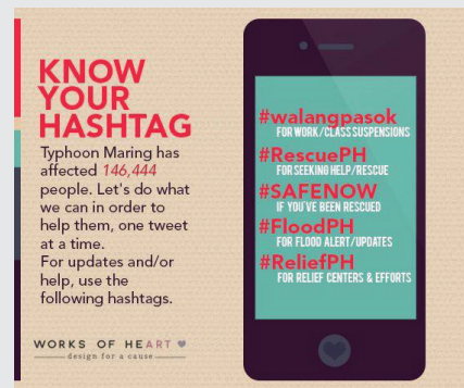
Figure 1: Infographic explaining hashtag use 47

The #RescuePH program was initially very successful. However, with succeeding uses, high-profile Twitter users started promoting the response hashtags, resulting in needs requests becoming lost in numerous fan retweets. 46 Additionally, a small yet growing number of tweets were stating how a user “should” write an emergency request, rather than providing the types of information desired. 4,48 Such problems related to @replies, retweet duplication and “how-to” tweeting are part of the reason why researchers are pushing for Government standardization of Twitter use during emergency response. 2,21,49,50