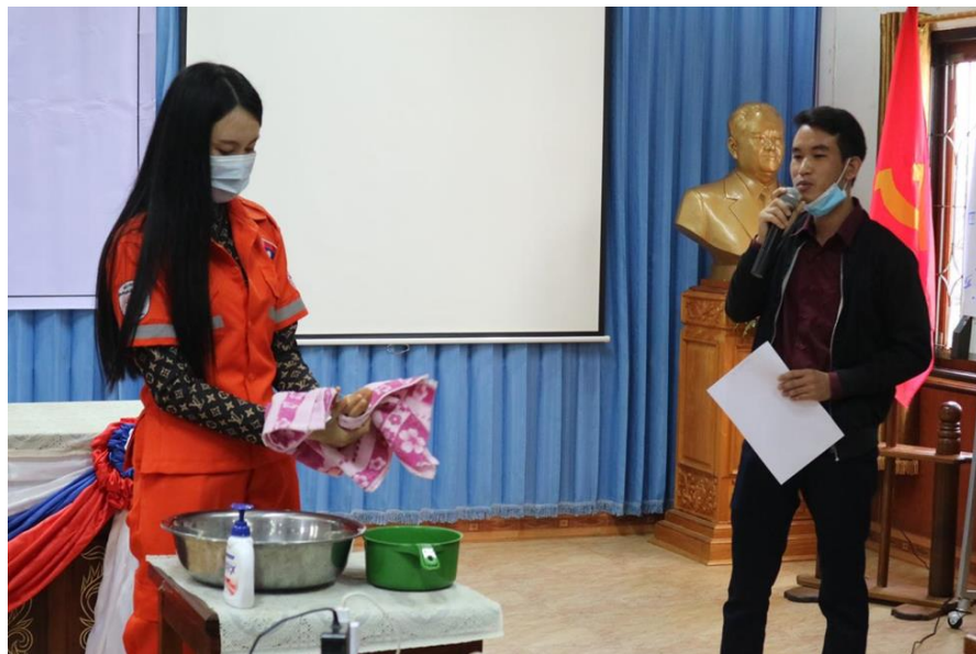
Trainer demonstrates the process of explaining proper hand-washing technique to the community.

The Lao Red Cross (LRC) team has reached 11,177 people with information and assistance for protection from COVID-19, during the past few months. Training staff and volunteers on basic measures of self-protection and training on fielding queries from the public is key to ensuring that accurate information reaches people all over the country. During June, LRC completed a training on “COVID-19 basic knowledge” for 68 staff (34 female) in the branches of Bokeo and Luangprabang. The training covered topics such as