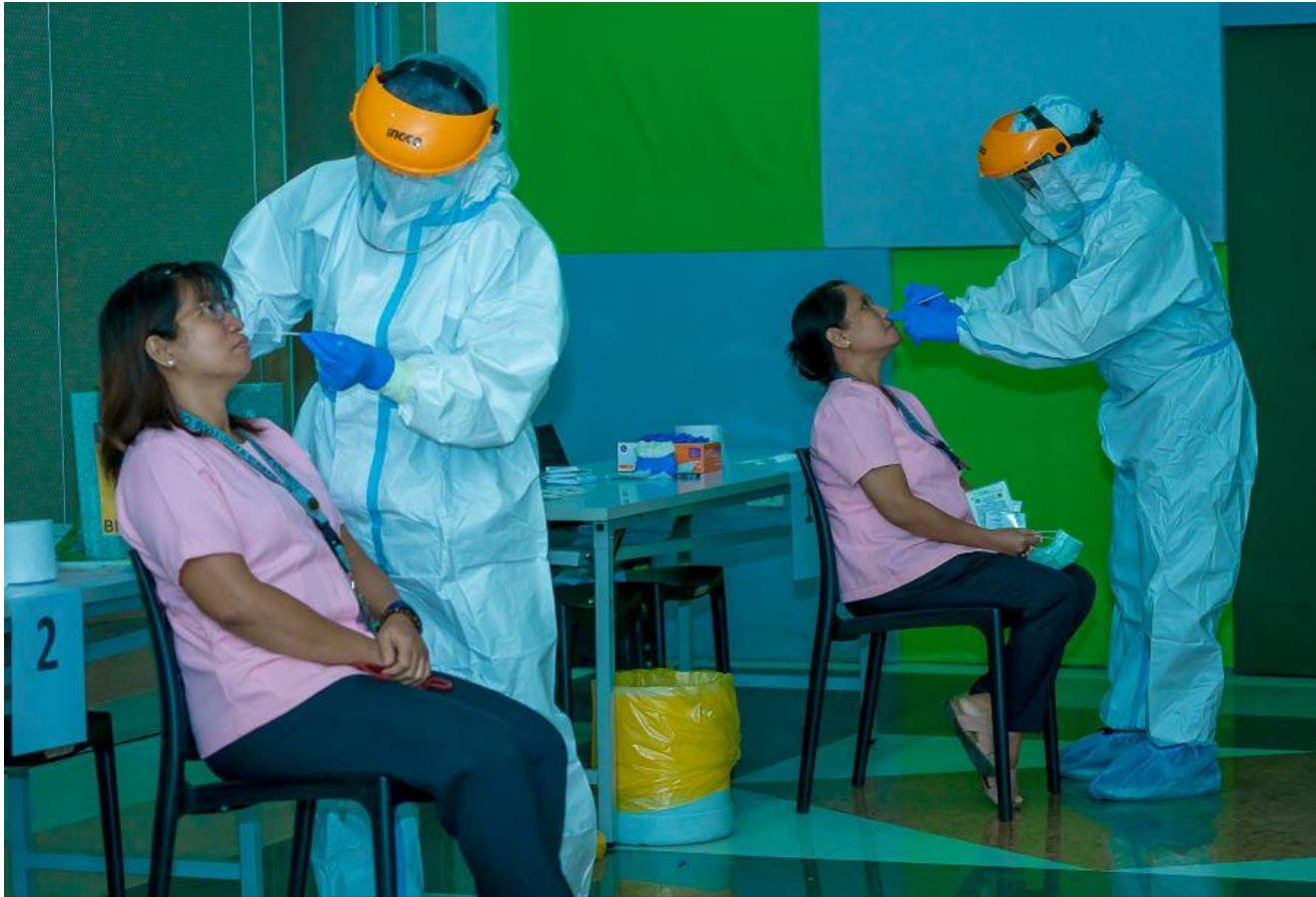
Health care workers undergoing tests for detecting COVID-19 infection in Manila.

To help protect those who are working on the frontline, the Philippine Red Cross (PRC) has partnered with hospitals to conduct testing for COVID-19 for health care workers. PRC has committed to regularly test medical workers in 15 hospitals in the National Capital Region every 14 days. As of 26 June, 4,315 front line health care workers have been tested and 54 were found positive for coronavirus. The testing will soon be expanded to cover thousands of healthcare workers both in government and private hospitals across the country.