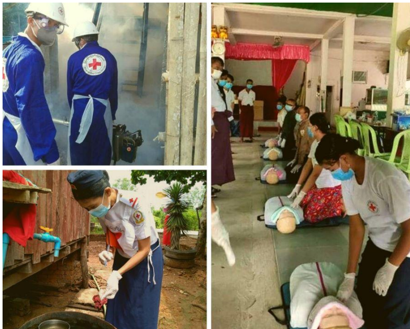
Left: MRCS volunteers conduct fumigation for Dengue prevention in Mon state. Right: A session at the First Aid Training in Yangon.

Separately, MRCS is strengthening its corps of First Aid providers by conducting regular trainings. During June, MRCS held three trainings on Psychological First Aid, Basic Life Support, Protection, Gender and Inclusion (PGI) for 67 MRCS volunteers (29 women) with a focus on COVID-19, in Yangon. The training is