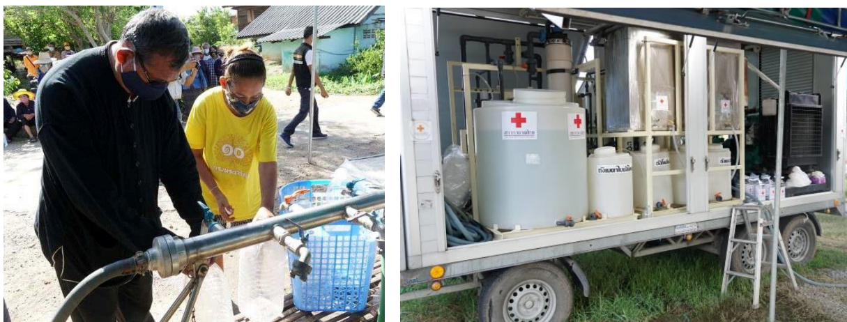
People collect purified drinking water in their containers. The water purification system deployed by TRCS is on the right.

The Relief and Community Health Bureau of the Thai Red Cross Society (TRCS), dispatched an Emergency Water Purification Unit producing 20,000 liters of safe and clean drinking water per day, to those affected by drought in 48 villages of Noen Kham District in Chai Nat Province during 6 – 22 June 2020. In April, the Department of Disaster Prevention and Mitigation (DDPM), had declared a drought in 25 provinces covering 6,846 villages in 146 districts. In addition to its COVID-19