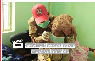
Serving the country's most vulnerable

MRCS is extremely concerned for people who have been displaced and migrant workers who have been forced to return home from neighboring countries like China and Thailand. These at-risk groups are a priority for MRCS's response efforts, which has included sending trained volunteers to border crossings with China and Thailand as well as community-based quarantine facilities.