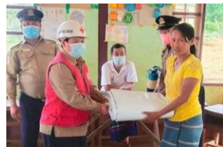
Photo: Assessment and dissemination of essential relief items in Southern Shan where 17 houses were destroyed by the cyclone Amphan last week.

MRCS has long been helping communities prepare for disasters , including pre-positioning emergency supplies, and this year also adding masks and disinfectants reflecting the developing situation as part of the supplies.