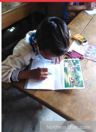
Northern Shan state