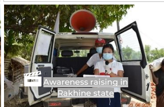
Awareness raising in Rakhine state