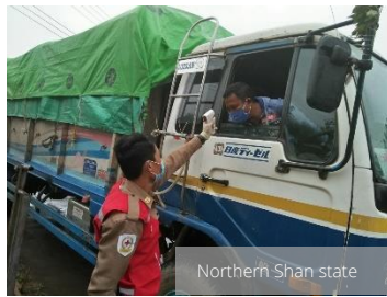
Northern Shan state

12,396+ activities in 235 townships as of 19 May 2020, 1,187 increase from 12 May 2020 organizing physically distancing awareness raising sessions and disseminating preventive information