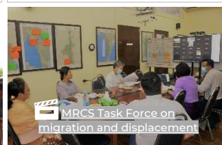
MRCS Task Force on migration and displacement