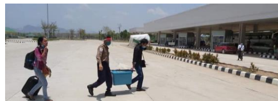
Myawaddy, Kayin state

Do you have inspiring photos of Myanmar Red Cross volunteers working on combatting COVID-19? Please message us via MRCS Facebook .