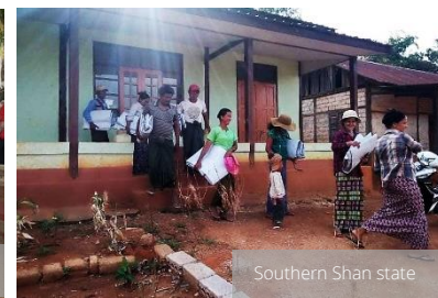
Southern Shan state

2,061+ activities in 80 townships, as of 19 May 2020, 83 increase from 12 May 2020 addressing psychosocial needs of COVID-19 affected population in quarantine facilities and communities