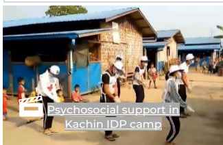
Psychosocial support in Kachin IDP camp