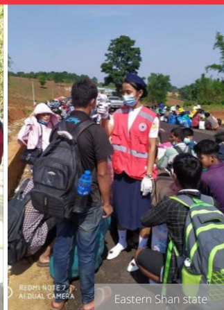
Eastern Shan state

7 fundamental principles guiding MRCS's work on COVID-19 and all times