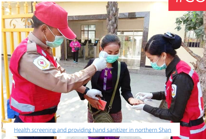
Health screening and providing hand sanitizer in northern Shan