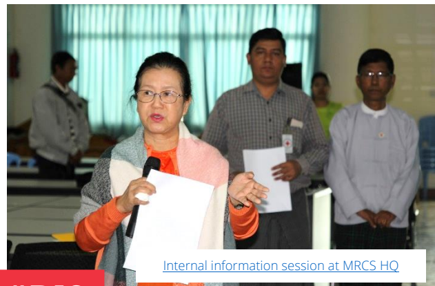
Internal information session at MRCS HQ