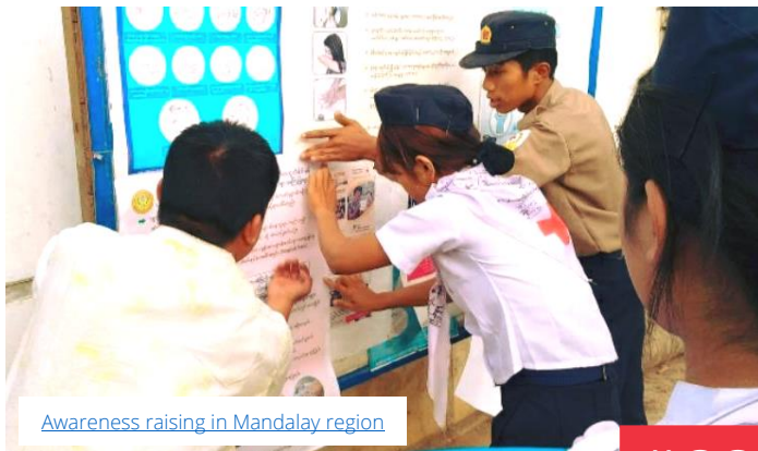
Awareness raising in Mandalay region

MRCS's response supported by the Red Cross & Red Crescent Movement partners in Myanmar