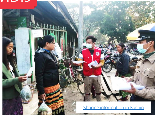
Sharing information in Kachin

Myanmar Red Cross Society (MRCS) has been in close coordination with the Ministry of Health and Sports (MoHS) at national, regional, and township levels and has mobilized a large number of Red Cross Volunteers (RCVs) and staff to support the MoHS responses in awareness raising, health education, screening of migrant people and community-based surveillance activities. MRCS launched procurement personal protective equipment (PPE), sanitizers, and masks and distributed information materials in communities and through social media. MRCS continues to lead the Red Cross & Red Crescent Movement (the Movement) Task Force which convenes twice a week to effectively and timely respond to the fast-evolving situation and to show solidarity as the Movement partners in Myanmar. To see more activities, please visit here .