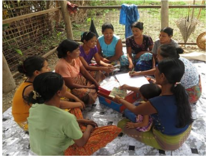
A monthly women's group meeting in Sittwe Township for savings activity

The CRP is jointly funded by British Red Cross and Norwegian Red Cross through a multilateral funding mechanism with IFRC. The Program directly support MRCS's strategic goal to "Build healthier and safer communities, reduce vulnerabilities, and strengthen resilience".