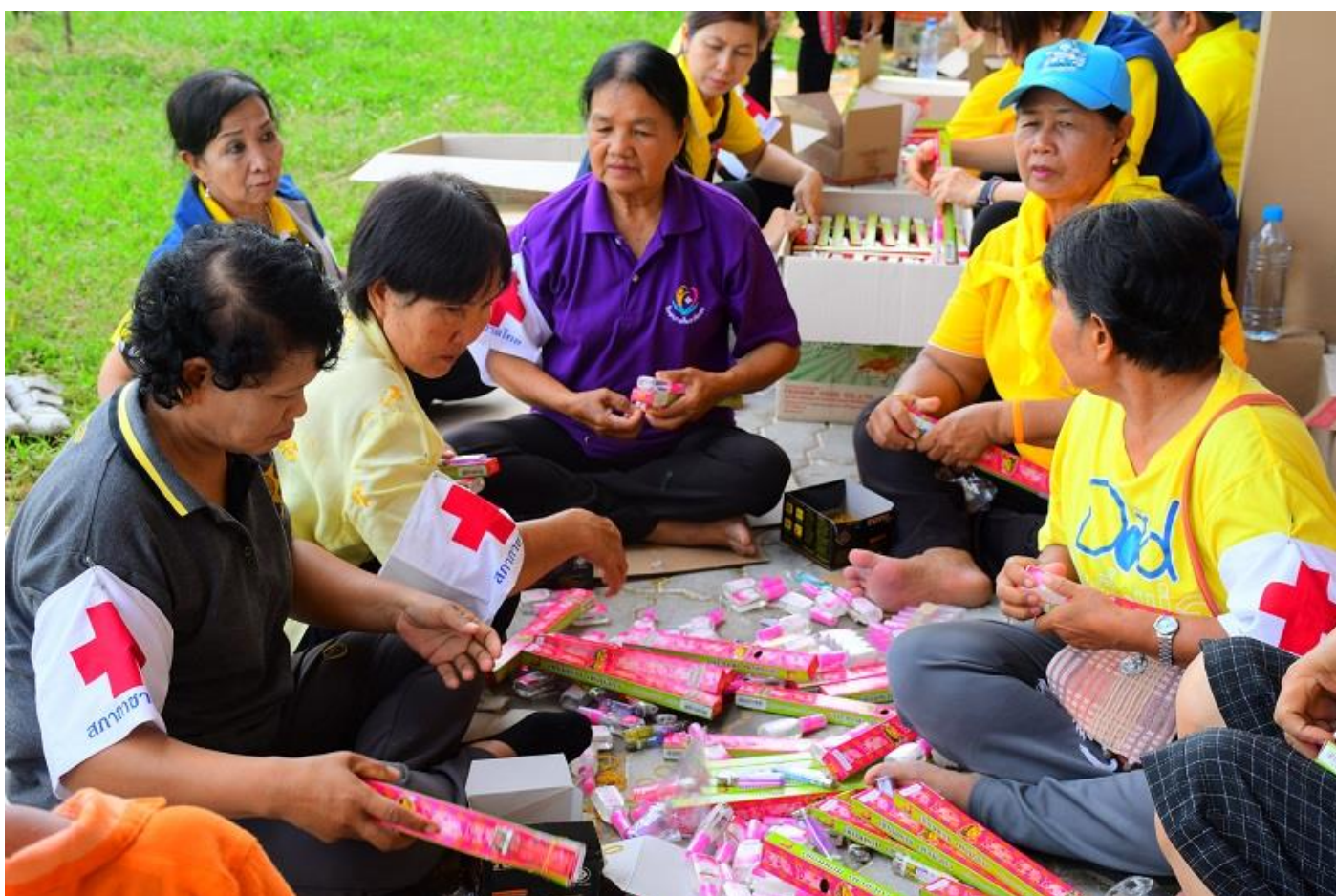
Thai Red Cross volunteers pack non-food items to be distributed to communities in north and northern provinces of Thailand that were affected by Tropical Storm Podul and Kajiki.

Welcome to our August 2019 Southeast Asia news updates. In addition to these monthly updates we send to you every month, you could also find Southeast Asia Red Cross Red Crescent's resources, tools, events and updates at Resilience Library at http://www.rcrc-resilience-southeastasia.org .