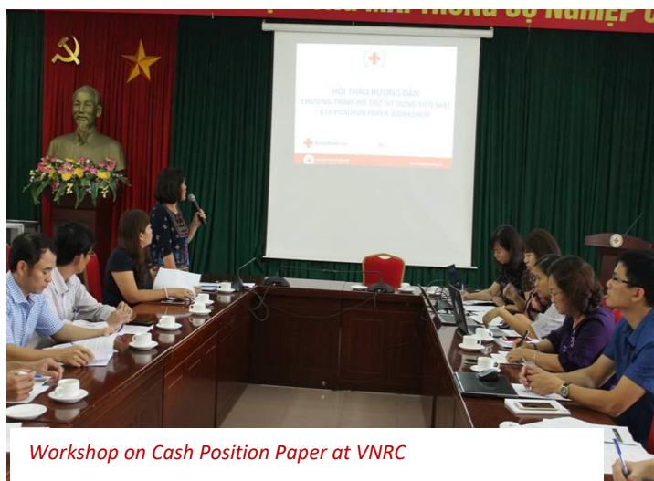
Workshop on Cash Position Paper at VNRC

The Position Paper which is still in its development phase, aims to provide practical guidance on CBI in emergencies outlining past experiences and current approaches while also highlighting the opportunities that exist for scaling-up of cash programme in the future. Furthermore, the Cash Position Paper complements the VNRC Development Strategy 2020 and is aligned with the Movement's global commitments to enhancing national society capacity to deliver more effective and efficient cash-based interventions.