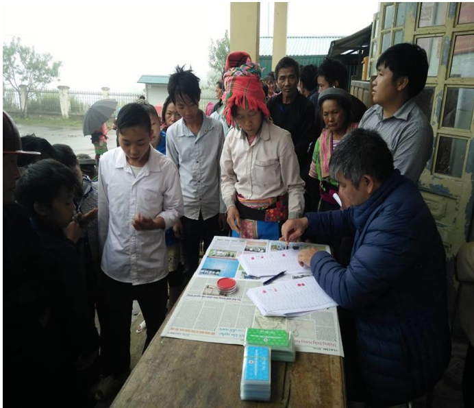
Distribution of unconditional cash grant to support basic needs of people affected by flood in Lai Chau province, Viet Nam

The Viet Nam Red Cross Society (VNRC) is one of the leading humanitarian organization in Viet Nam with clear roles in responding to disaster and emergency situation. As an auxiliary to the government, VNRC works closely with the government structures at national, provincial and community level to provide assistance to vulnerable household affected by disasters. In this capacity, it is recognized as the first agency to deliver much needed relief and support the long-term recovery of disaster affected populations in the areas of food, non-food items, water, hygiene and sanitation, livelihoods and shelter.