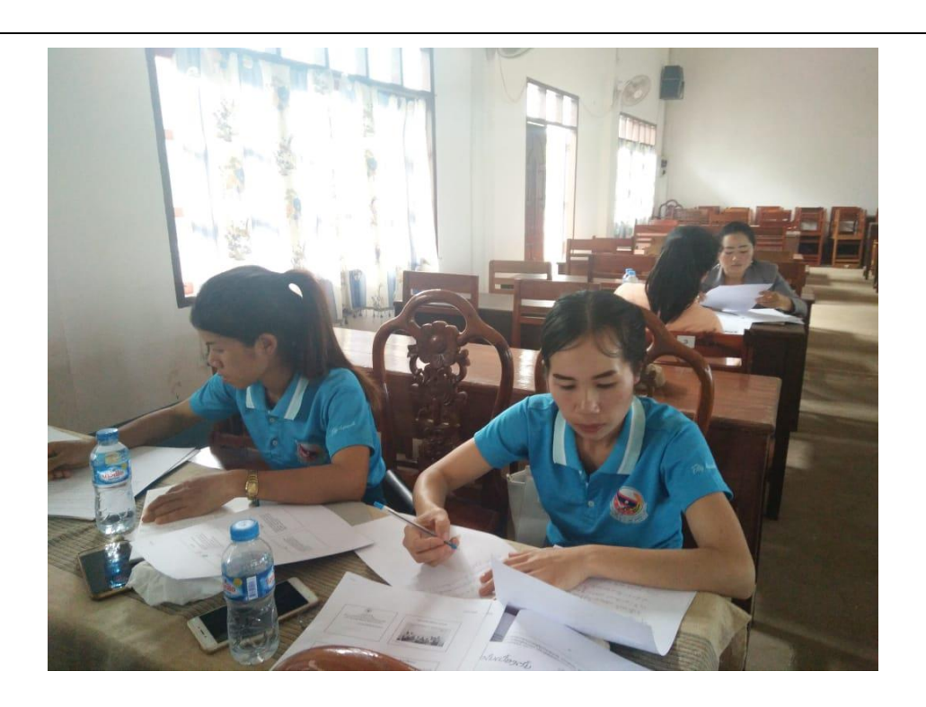
G&D training 23 – 24 July 2018, Baeng district