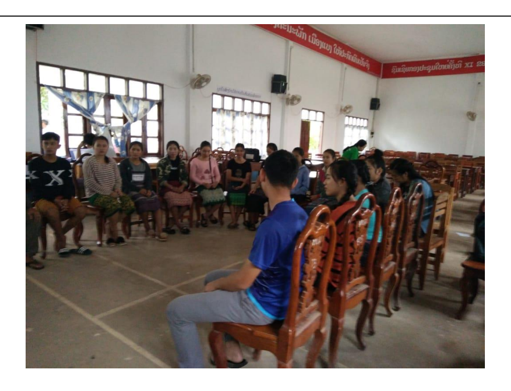
Youth training on YEC 25-26 July 2018, Baeng district