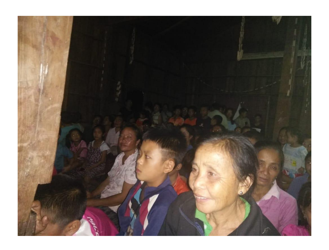
Villagers attended the awareness activity in the evening 27 – 28 July 2018