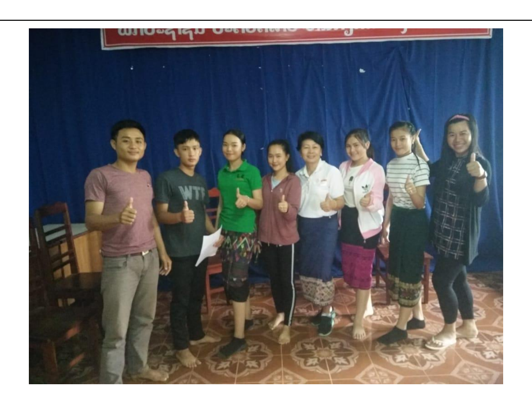
Youth practiced the play called "Mirror" focusing on domestic violence. 25-26\ \text{July}\ 2018