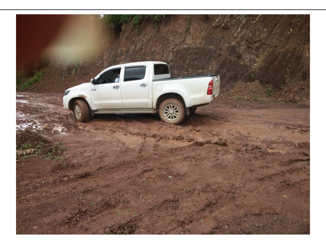
Road condition in Baeng district during the implementation of this activity.

Original report in Lao by LRC Deputy Head of the Advancement of Women, Mother and Child Work / LRC G&D focal person