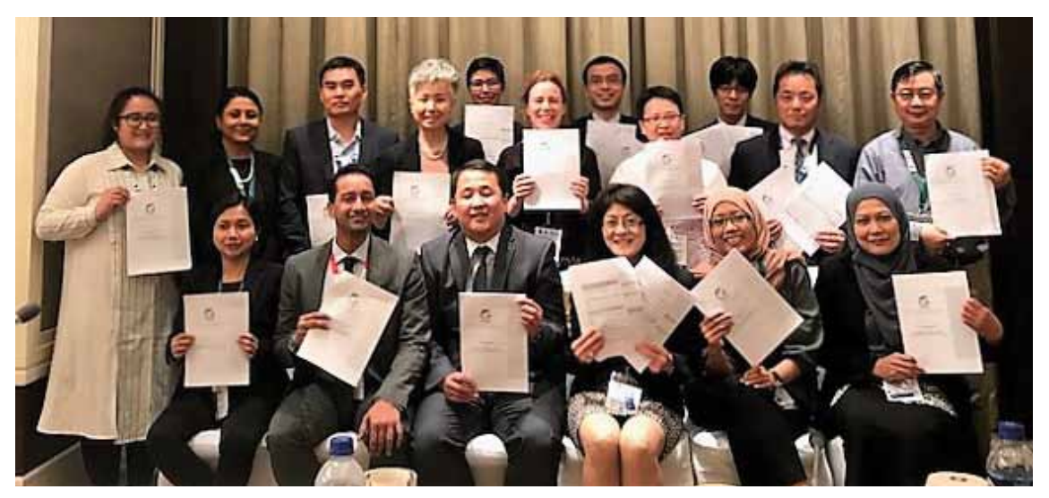
AMCDRR Drafting Committee happy to have finalised the outcome documents!

The committee was provided four different opportunities to provide written and verbal feedback on the various versions of these documents. During the Conference, the committee met in person to review the outcomes of the various technical and thematic sessions, including any wider feedback received on the outcome documents and continued negotiations until agreement was reached on both documents.