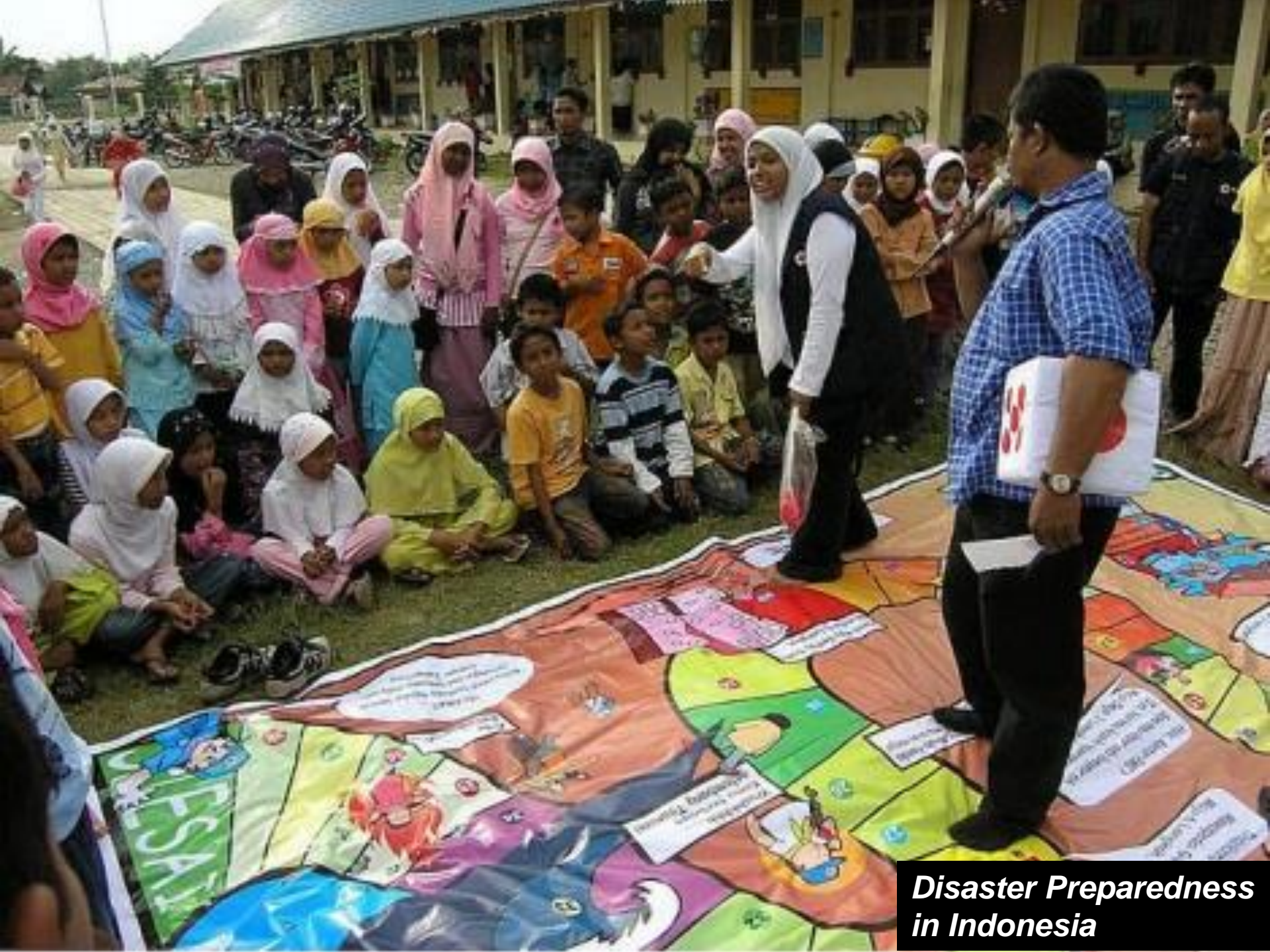
Disaster Preparedness in Indonesia