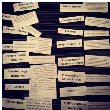
Climate Masters Training