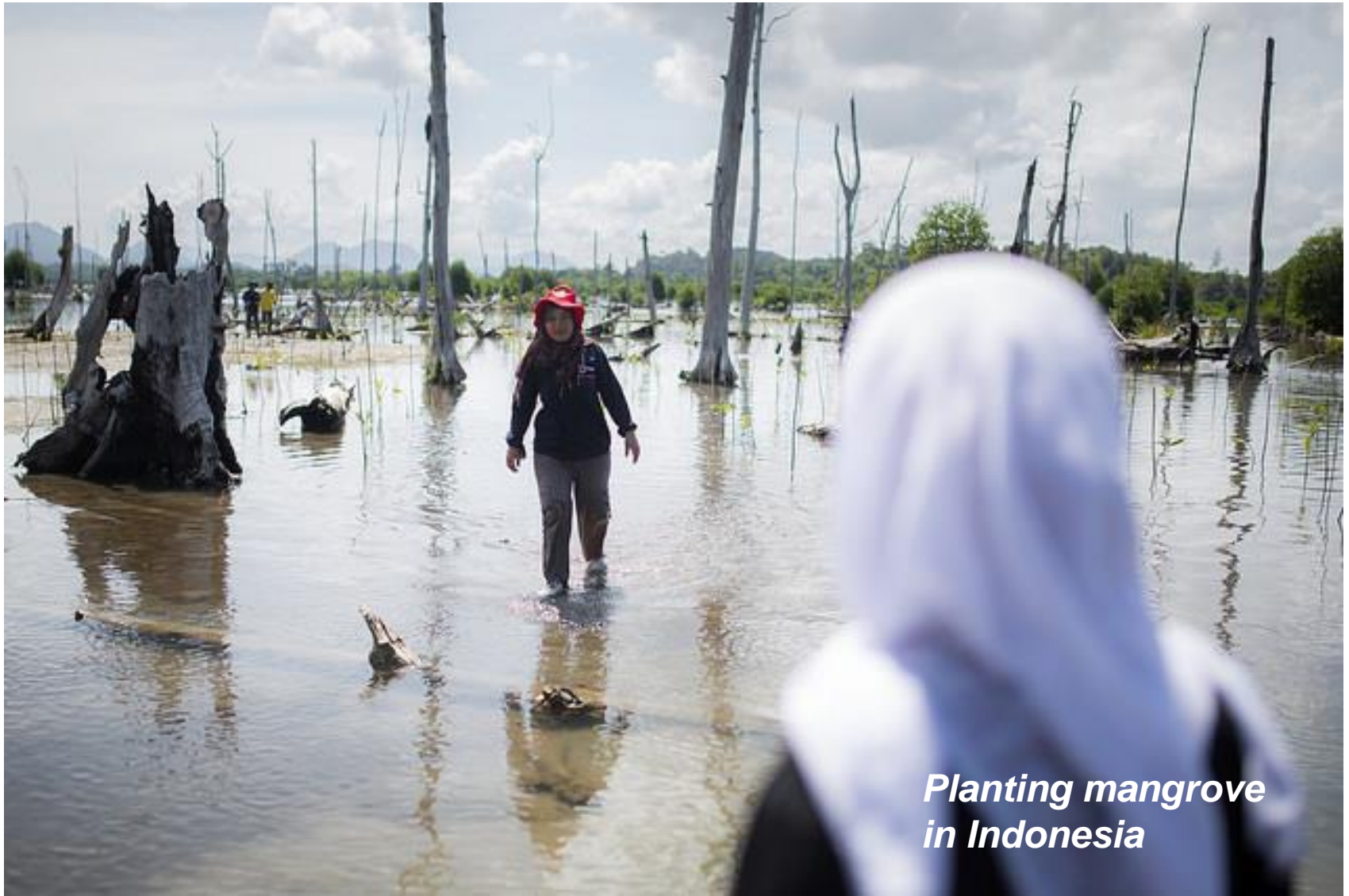
Planting mangrove in Indonesia