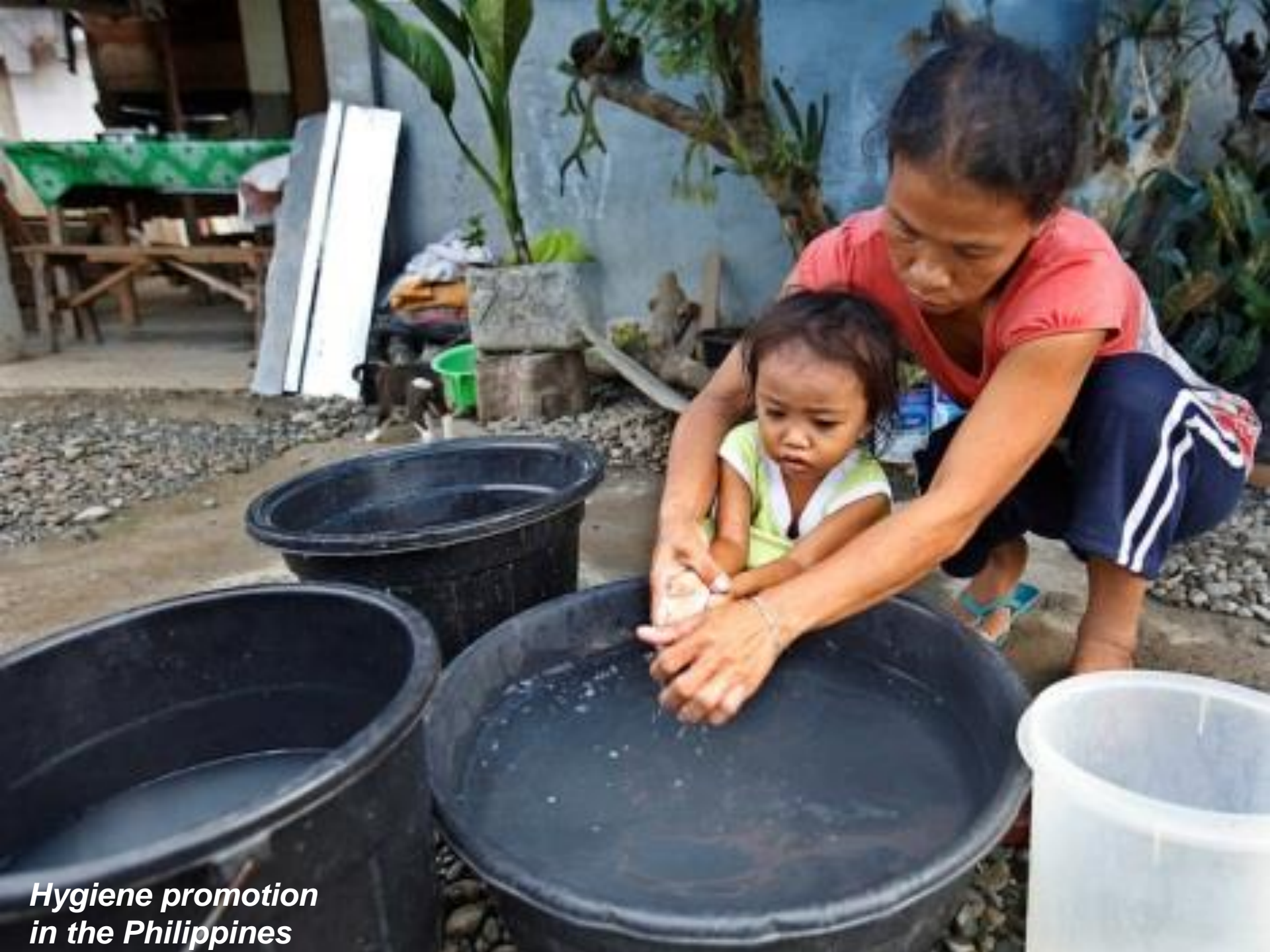
Hygiene promotion in the Philippines