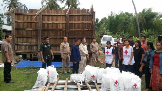
Relief kits distributed to people in Surin Province.

During 23-26 April 2018, tropical storms hit 20 provinces in north and northeast part of Thailand, affecting 1,042 household and 1,384 people. Thai Red Cross Health Stations in the affected provinces visited the affected families and provided them with relief kits.