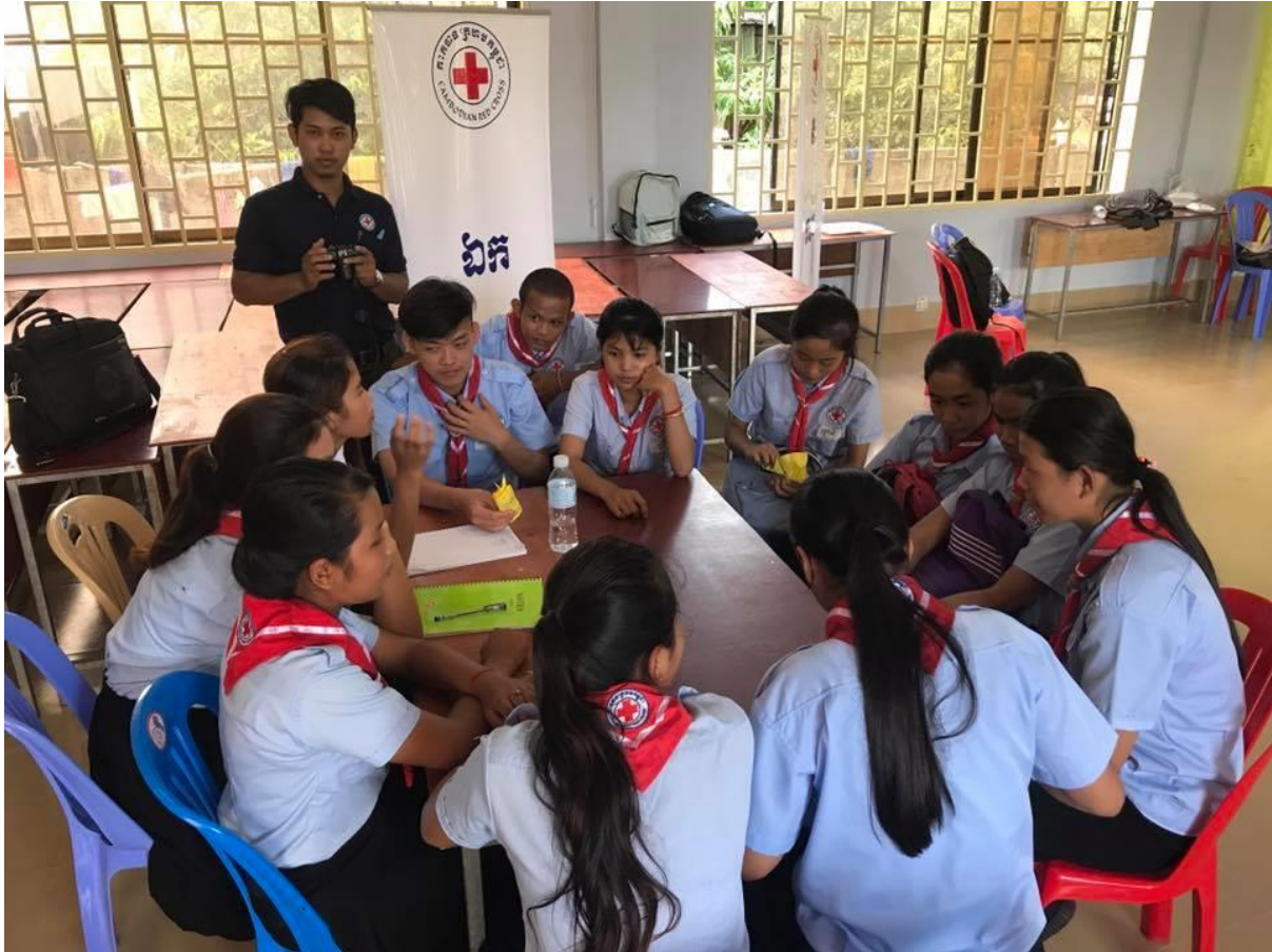
Fig. 1 Students participating in the Cambodian Red Cross School Safety Program