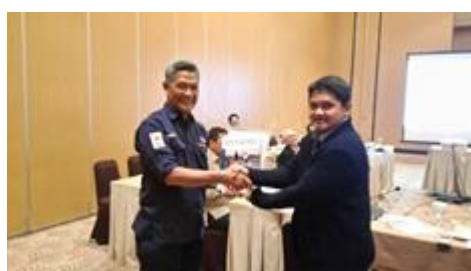
In commemoration of the 10th anniversary of the disaster management law in April 2017, PMI and AMPU conducted a reflection on disaster management in Indonesia and how to strengthen the national disaster management law.