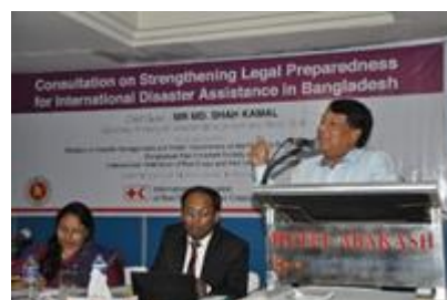
A multi-stakeholder consultation convened in Dhaka on 16 April 2017 entitled “Strengthening Legal Preparedness for International Disaster Assistance in Bangladesh”.

Currently there are draft laws and policy processes in which IFRC and National Societies of Lao PDR, Mongolia, Nepal, Bangladesh, Philippines, Indonesia, Cambodia, Samoa, Tonga and Vanuatu are actively engaged. In partnership with UNDP, ADB and Government of Lao PDR , IFRC supported the international and national partners consultation in Lao PDR on the Climate Change Law. The revised draft of the Climate Change law was presented to the Ministry of Justice at the end of 2017.