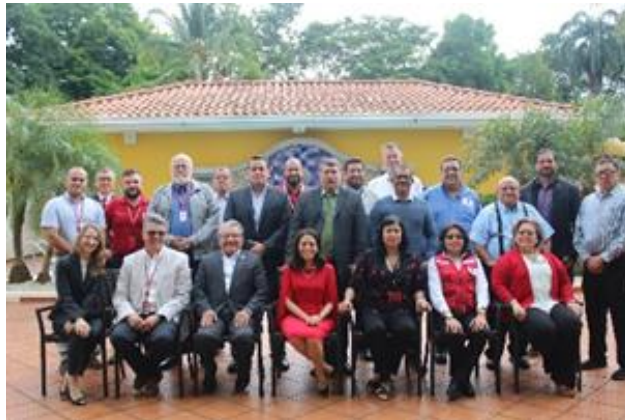
Disaster Law expert group from Central American National Societies, meet in Panama City, for the Regional Workshop on Auxiliary Role and Humanitarian Diplomacy, August 2017.

In Colombia , the National Society, in collaboration with the national authority responsible for disaster risk management (UNGRD), continued an evaluation of national laws relating to disaster risk reduction and their implementation, using the Checklist for DRR Law as a reference. The report is currently in its final round of assessment and is expected to be completed in the first quarter of 2018.