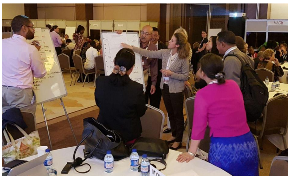
Workshop on 'Setting the Resilience Agenda: Showing Leadership in Disaster and Climate Policy', Council of Delegates, Turkey, November 2017

This report covers the period: 01/01/2017 to 31/12/2017