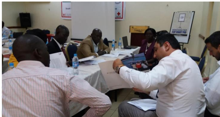
The MHADM, SSRC and IFRC co-organised and co-facilitated a workshop on IDRL in March 2017