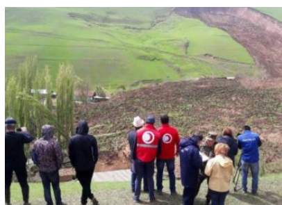
Kyrgyzstan, which suffered from severe landslides in 2017, adopted a new law based on the IDRL Model Act and CIS Model Law.