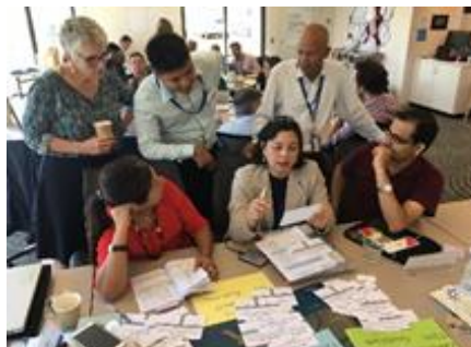
Asia Pacific Disaster Law Field School bringing together priority Asia Pacific National Societies, governments and regional disaster management organisations.