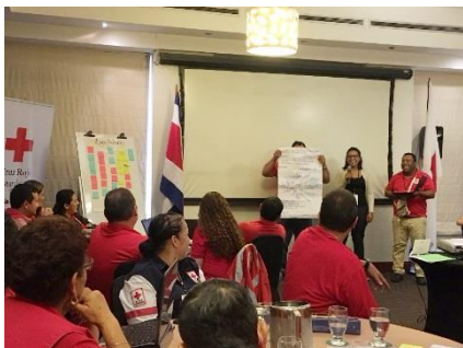
Representatives of the Costa Rica RC meet to discuss and reflect on their mandate and auxiliary function, and develop a new plan of action and strategy for the promotion of stronger disaster laws and peer-to-peer learning in this area.