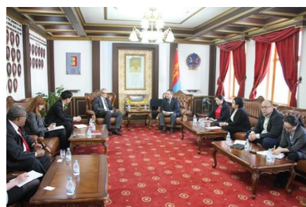
Representatives from the IFRC and the Mongolian Red Cross Society met with Dorlijav Dambii, Mongolian Minister of Justice