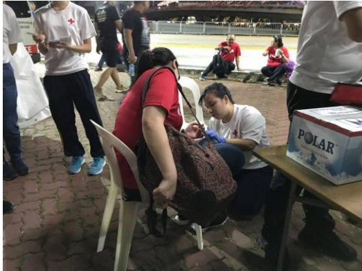
SRC provided first aid to Chingay Parade participant.

Singapore Red Cross (SRC) is a firm advocate of enhancing community resilience to reduce vulnerability, strengthen preparedness, early response, and recovery of individuals, communities, and countries in crisis situations. In Singapore, community resilience constitutes a part of total defense, which calls for citizens to play a role in keeping Singapore strong, secure and cohesive.