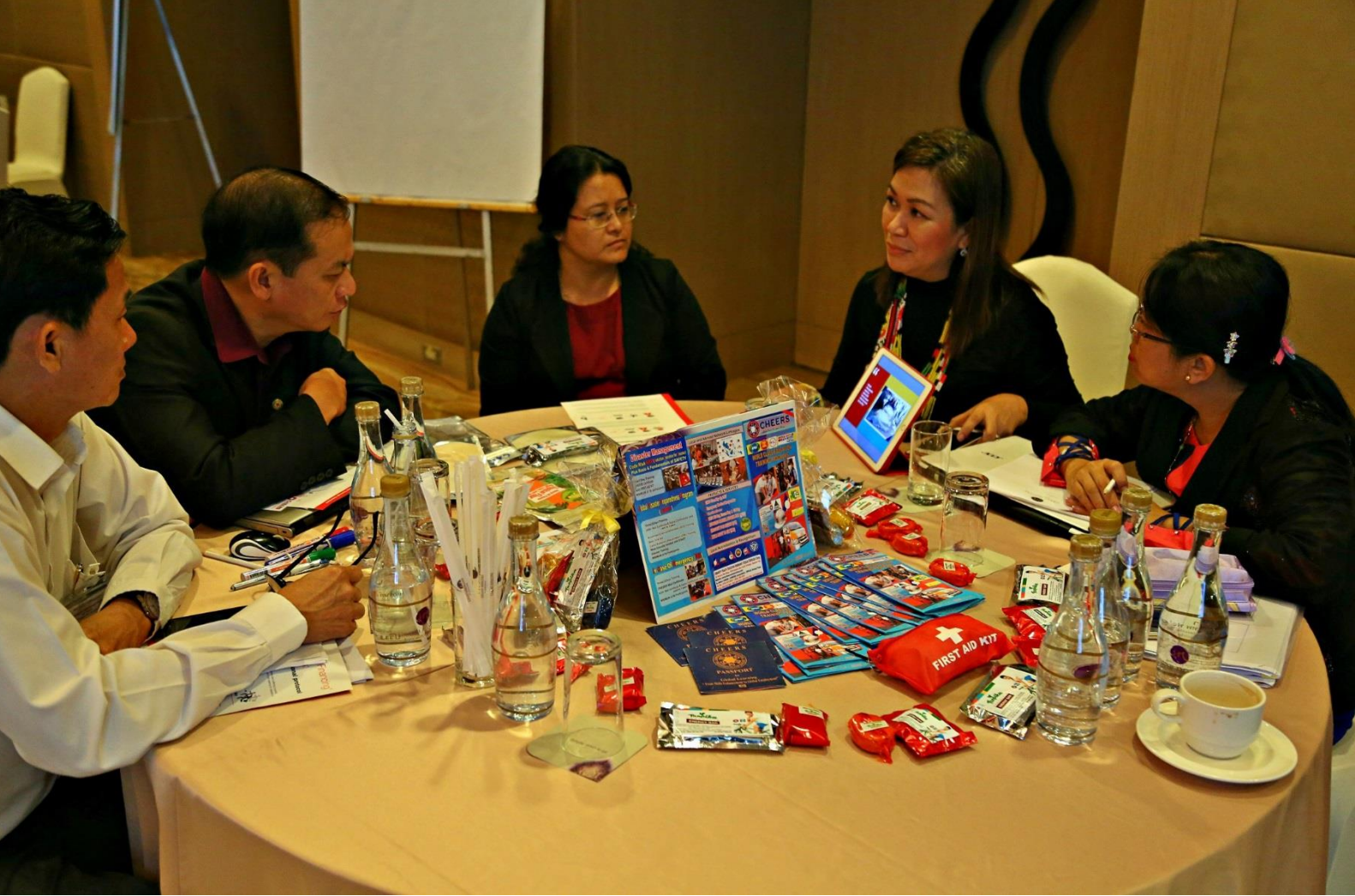
Session 6 Thematic session 3: Financing for Development