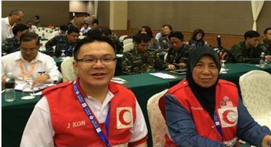
Malaysia Red Crescent gearing up for the table top exercise