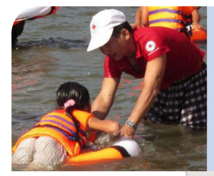
Flood preparedness simulation Viet Nam Red Cross organizes a simulated flood response for students.

Session on disaster and climate change targeting primary school students.