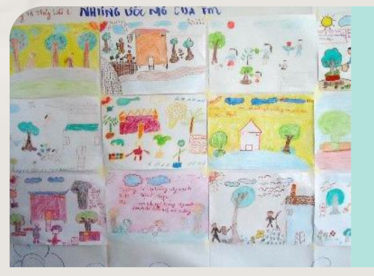
Campaigns and competitions Competition for students on disaster and climate change knowledge.