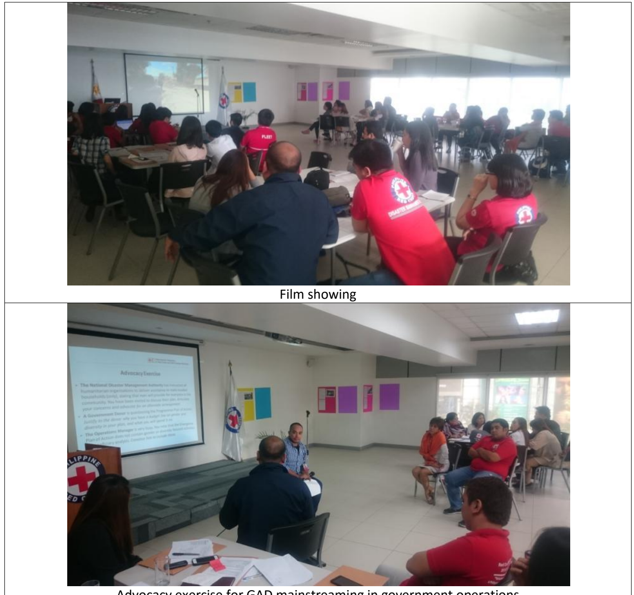
Advocacy exercise for GAD mainstreaming in government operations