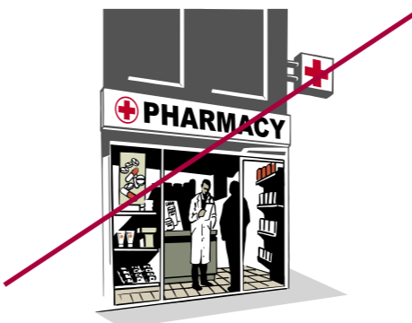
Illustrations: E. Boero

Any use of an emblem inconsistent with international humanitarian law. The use of an emblem by unauthorized people or entities (commercial enterprises, pharmacists, private doctors, non-governmental organizations, individuals, etc.) or for purposes that are likely to undermine the prestige or the respect due to the emblem.