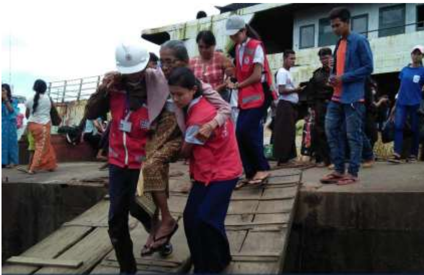
Photo: Myanmar Red Cross volunteers assisting the people who fled from Maungdaw and Buthedaung to Sittwe in Rakhine State