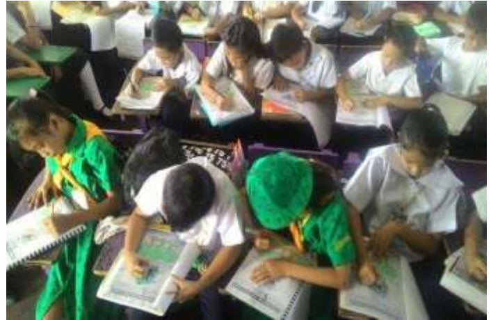
Students from Pres. Corazon C. Aquino Elementary School, utilizing the PRC Workbooks in aide during their school Re-Echo Sessions.

1.7.1 Identify small mitigation based on SDRRM Plan and conduct technical assessment; Coordinate with stakeholders for support/co-funding. Proposals are being finalized by the schools. City Engineering is working on the Programs of Works of each project.