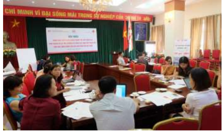
The participants giving opinions on Gender and Diversity mainstreaming

While these VCA guidelines have been highly appreciated and widely used it has been clearly lacked consideration for Gender and Diversity (G&D). It is clear that women, men, boys, girls, people with disability and people belonging to diverse ethnic, social, cultural, economic and religious groups may have different level of vulnerability and capacity towards disasters. A Gender-and-Diversity-sensitive and inclusive VCA will help us understand and address the specific needs, capacities and priorities of each group in a comprehensive way and ensure that no one is neglected. Gender and Diversity play a vital role in achieving VCA's goals, improving disaster response capacities of all specific groups and all the community.