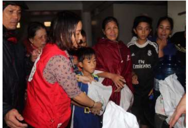
Distributing relief items at an evacuation centre in Ha Tinh.

The Viet Nam Red Cross headquarters has released its pre-positioned stock including 600 shelter tool kits and emergency response funds (equivalent CHF 67,000) to provide initial support to the affected population. Resource mobilization is on-going in order to continue with its emergency operation and the future recovery program.