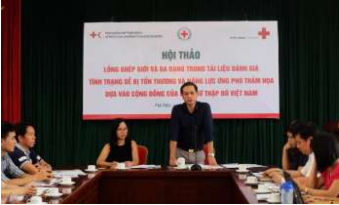
The workshop was attended by many Gender and Diversity, and DRR experts