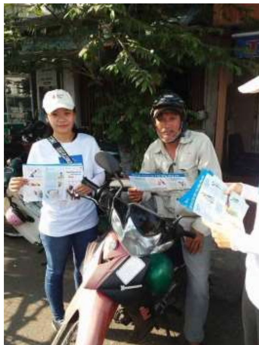
Distribution of leaflets to motorbike taxi drivers in Quy Nhon city.

The distribution in the five wards of 20,000 leaflets with illustrations of four behaviours, and the setting up of 8 billboards in key public spaces also ensured the campaign outreach.