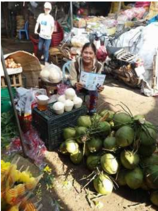
Distribution of leaflets in local market of Quy Nhon city.