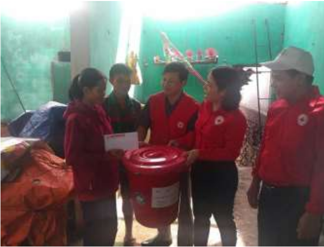
Viet Nam Red Cross team visiting an unroofed house in Ky Anh district, Ha Tinh