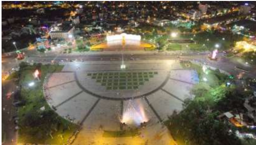
Flycam view of the popular square for families and youth where took place the flashmob event

been posted on the page and has reached nearly 3000 people online since its upload on the 1st September and a total of nearly 6000 people have visited the Facebook page so far.