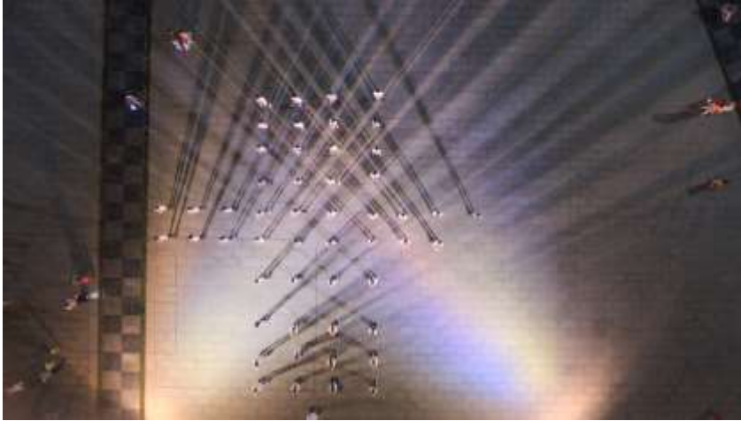
Flycam view on the flashmob event in Quy Nhon City.

been posted on the page and has reached nearly 3000 people online since its upload on the 1st September and a total of nearly 6000 people have visited the Facebook page so far.