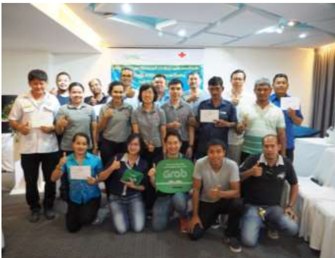
Phang Nga Red Cross Station.

From http://www.rcrc-resilience-southeastasia.org/event/grab-taxi-drivers-training-on-basic-first-aid-phuket-31-august-2017/