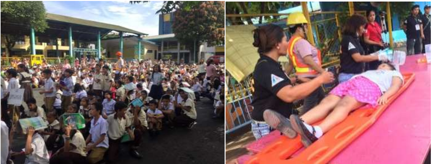
Earthquake drill at Diosdado Macapagal Elementary School.

1.4.1 Conduct (or update) a comprehensive Vulnerability and Capacity Assessment through a participatory approach: The VCA reports were completed in Bagong Silangan Elementary School (Brgy. Bagong Silangan), Pres. Corazon C. Aquino Elementary School (Brgy. Batasan Hills), Batasan Hills National HS (Brgy. Batasan Hills) and Bagong Silangan (Brgy. Bagong Silangan HS. These reports are currently being reviewed at NHQ (PRC). Furthermore, Diosdado P Macapagal ES and Dr. Josefa Jara HS (Brgy. Tatalon) VCA reports are been reviewed at Chapter level. Betty-go Belmonte ES and Carlos L. Albert High School's VCA reports (Brgy. Dona Imelda) are officially finalized and submitted to NHQ (PRC).