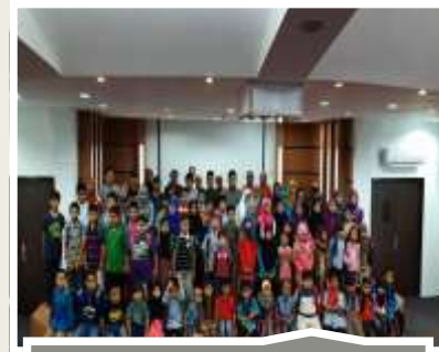
Projek IKHLAS 5.0 for under-privileged children