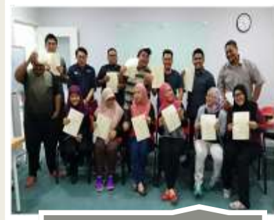
First Aid Certification