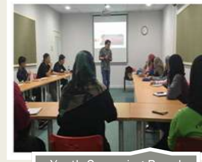
Youth Governing Board Induction