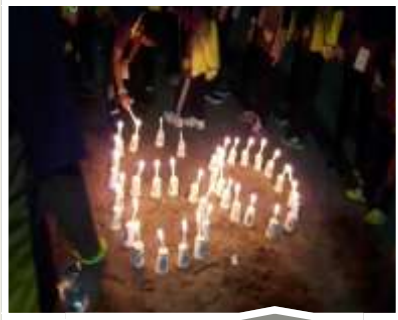
BRC Earth Hour