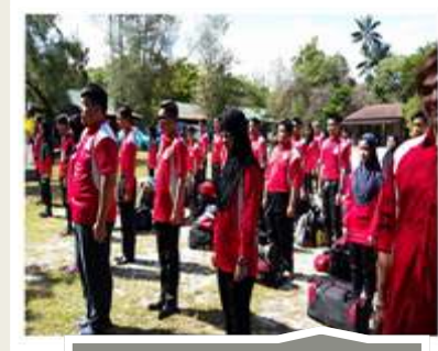
Henri Dunant Camp