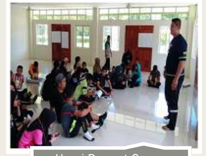
Henri Dunant Camp- Disaster Preparedness