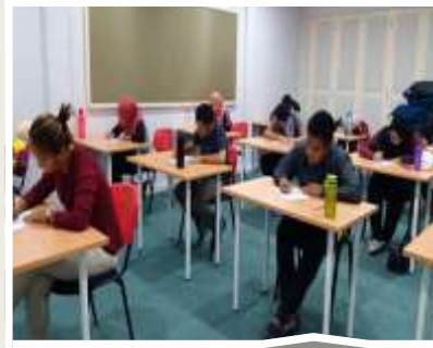
First Aid Competency Test