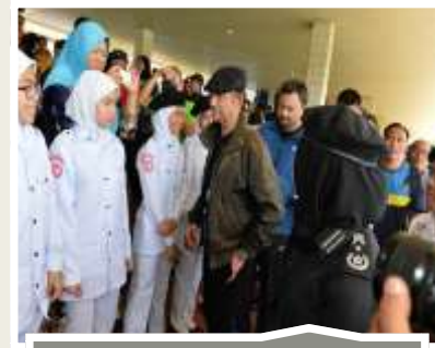
Youths with HM @ Bandarku Ceria