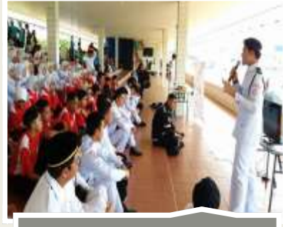
Youth Leadership Convention