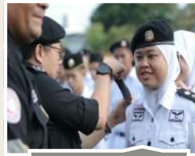
Henri Dunant Leadership Award