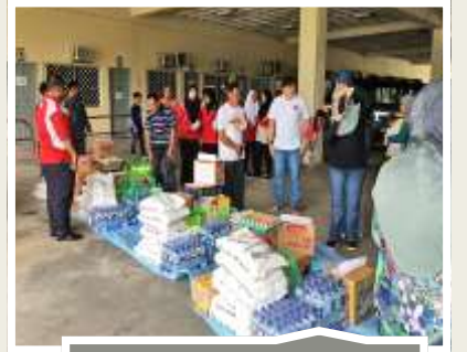
Projek IKHLAS for fire victims