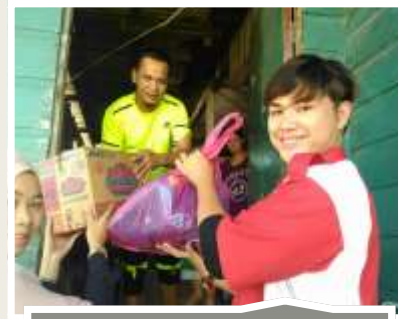
Food Aid Drive during Fasting Month