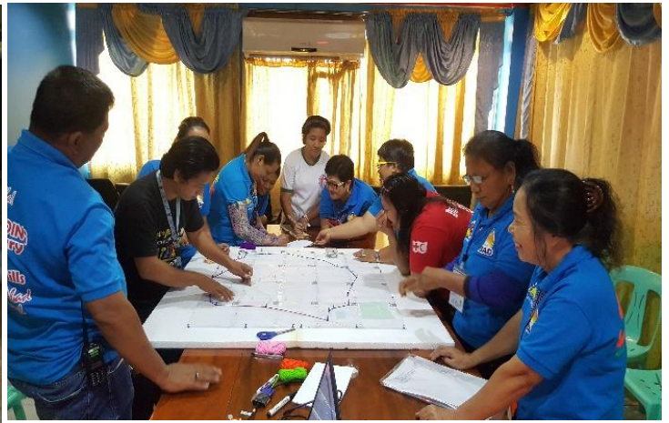
QGIS Re-Echo Workshop held last July 7, 2017. Brgy staff and volunteer are working on the identification of the critical infrastructures in their Brgy prior plotting it in the application.