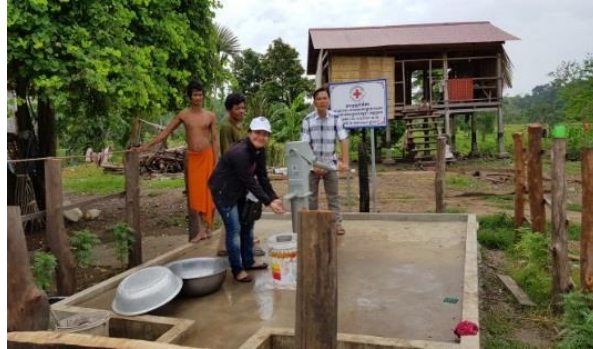
Photo: Shallow Tube well- Hand pump construction at different locations in Por and Lovea villages.

Construction of 6 shallow tubewell (hand pump) facility at Por and Lovea villages was started in May and completed in July month. It benefitted 242 households (1280 people).