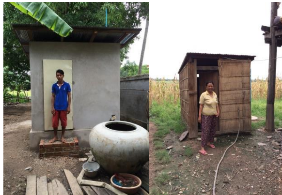
Photo: Household sanitation.

Red Cross Volunteers meeting on program issues and achievement: the meeting was organised to understand the issues regarding the programme and various achievement and quarterly progress of the programme.