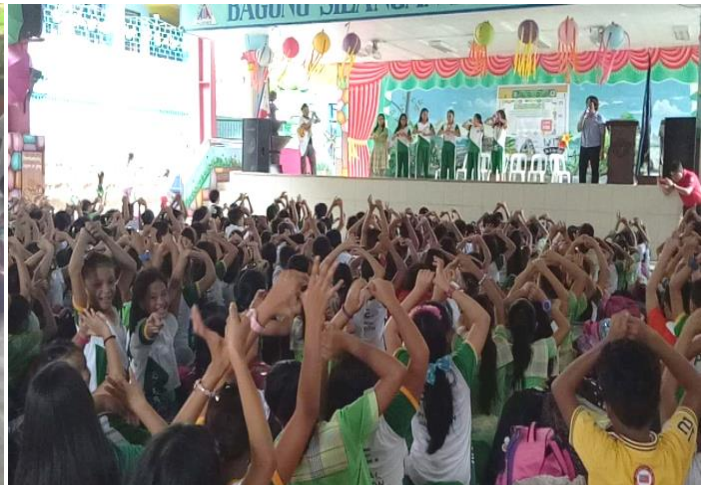
Students from Bagong Silangan ES demonstrating the proper handwashing techniques held last July 7, 2017 at the school.

Result 1: Children and youth are more resilient to disasters and have a safe and secure learning environment in 8 urban public schools in The Philippines, through improved Red Cross contributions to the ASEAN Safe School Initiative (ASSI).