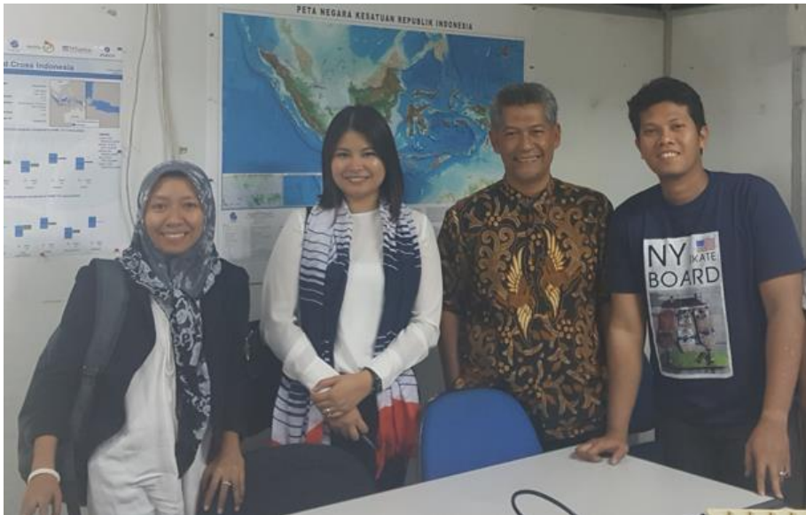
Representatives of IFRC and PMI

In preparation for this, Red Cross will be conducting research on integrating disaster risk reduction, climate change adaptation, and spatial policy in Indonesia. The research forms part of the recommendations of the recent report Strengthening Law and DRR in Indonesia: Checklist Assessment Report launched by PMI and IFRC last year. The report used the "Checklist on Law and DRR" to evaluate the strengths and opportunities of the Indonesian legal framework on the subject. The new research will be taken forward under the Partners for Resilience , a coalition advocating for integrated risk management as an approach towards building resilience of which PMI is an active member.