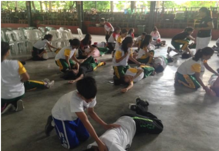
Emergency First Aid Training for BERT “Batang Emergency Reponse Team”, a refresher course in Carlos L. Albert High School last July 12, 2017.