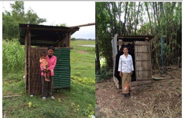
Photo: Household sanitation.