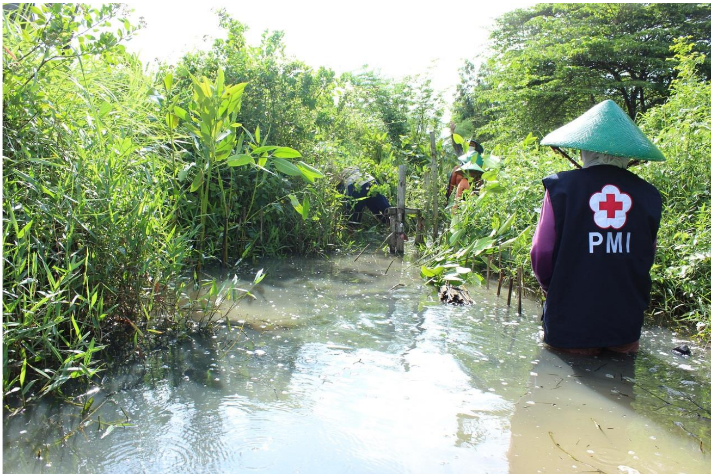
One million mangrove trees shield Indonesia's coastline from disasters.

Welcome to our July 2017 Southeast Asia news updates. In addition to these monthly updates we send to you every month, you could also find Southeast Asia Red Cross Red Crescent's resources, tools, events and updates at Resilience Library at http://www.rcrc-resilience-southeastasia.org .