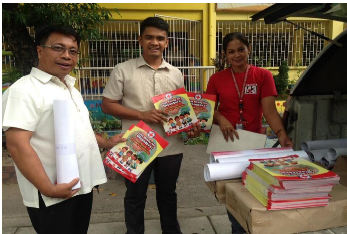
Distribution of workbook and posters in Carlos L. Albert High School as teaching IEC materials last July 13, 2017.

Result 3 - Increased capacity of local government authorities and Red Cross for disaster preparedness and response in 4 Brgys in Quezon City, The Philippines. After the City Level QGIS Training last April, a re-echo workshop was conducted in Brgy. Batasan Hills and in Brgy. Bagong Silangan