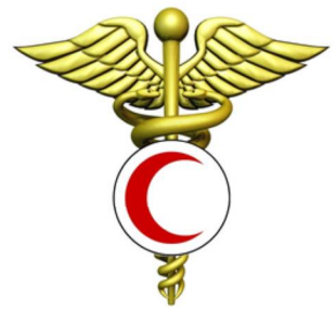
ACADEMY BRUNEI RED CRESCENT