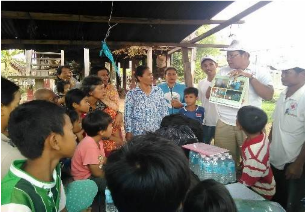
Hygiene Promotion awareness on water treatment at Chit-Borei district, Kratie, Photo: Cambodian Red Cross Society/Kratie

12-13 April 2017: Organizing of hygiene promotion awareness and education session on treatment methods for safe water and environment cleaning awareness the communities. 2-day home visit was conducted to create awareness regarding the treatment of water and safe storage at Talus, Boseleau Krom village, Boseleau commune, Chitr Borei district. Approximately 120 households visit conducted and 82 households participated in the village cleaning exercise.