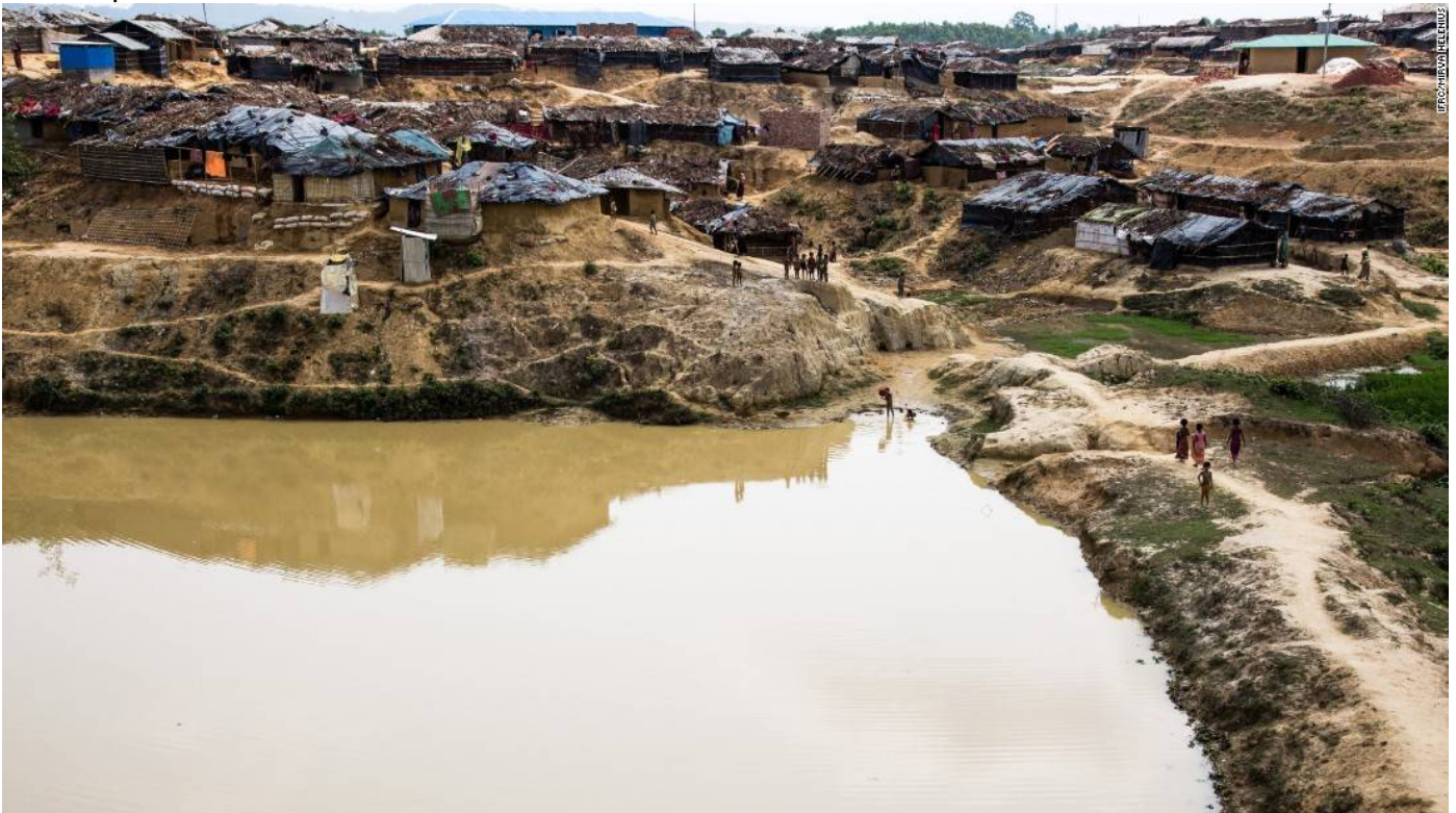
A makeshift extension to the Kutupalong camp in Ukhiya, Cox's Bazar district, southeastern Bangladesh on April 7.

Tarniz Sultana Sweety, a volunteer from the Bangladesh Red Crescent Society, during a tarpaulin distribution. Hide Caption