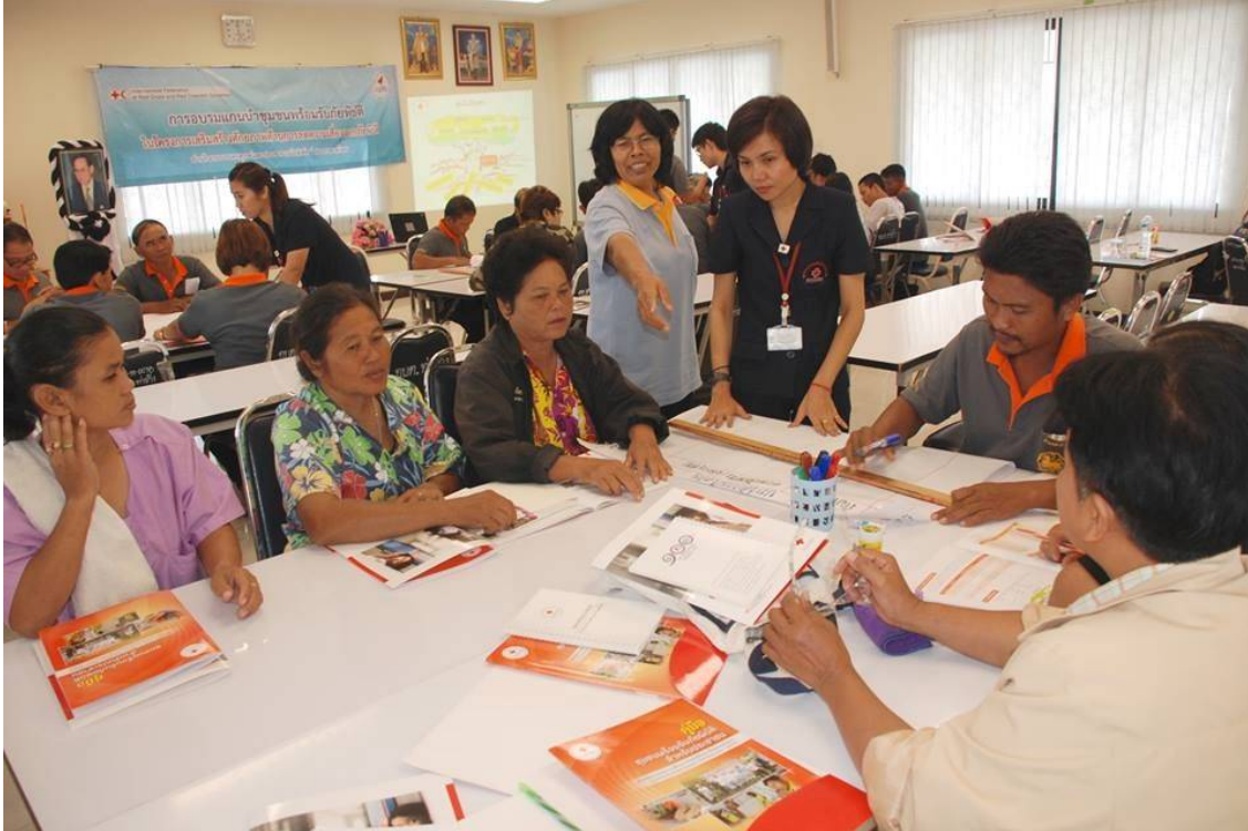
Vulnerability and capacity assessment (VCA) practice by women group.