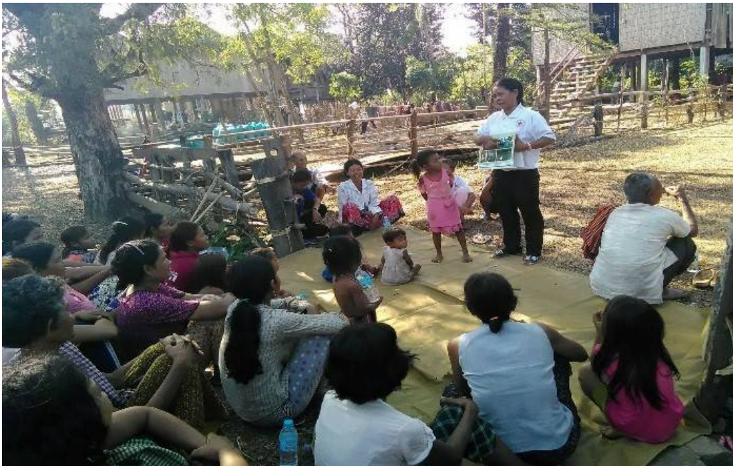
Hygiene promotion awareness on water treatment at Por village, Chit-borei district, Kratie, Photo: Cambodian Red Cross Society/Kratie