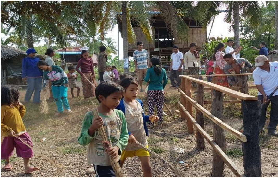
Village cleaning by households, Photo: Cambodian Red Cross Society/Kratie