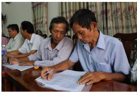
Participants were practicing scoring households in the training on beneficiary targeting on 9 April.

Between November and December 2016, the central part of Viet Nam was seriously affected by flooding as result of torrential rains. Among provinces affected, Binh Dinh was most hit. To support Viet Nam Red Cross (VNRC) to respond to the needs of affected population, New Zealand government released USD 250,000 through IFRC, focusing on addressing basic needs through unconditional cash grant and livelihood recovery by providing cows through conditional cash grant. To carry this forward, a training on beneficiary targeting were carried out on 8 and 9 in the districts of Tay Son and Tuy Phuoc, respectively. In total, 107 people (22 female) representing local departments of agriculture and rural development, veterinary, fatherland front, local authorities, head of hamlets and Red Cross staff at branches participated in the training to get familiarize with the VNRC's guidelines cash transfer programming (unconditional cash grant) and cow distribution through conditional cash grant focusing on beneficiary selection criteria, selection process and beneficiary communications.