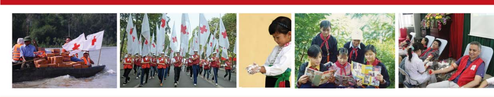
Humanity - Impartiality - Neutrality - Independence - Voluntary service - Unity - Universality