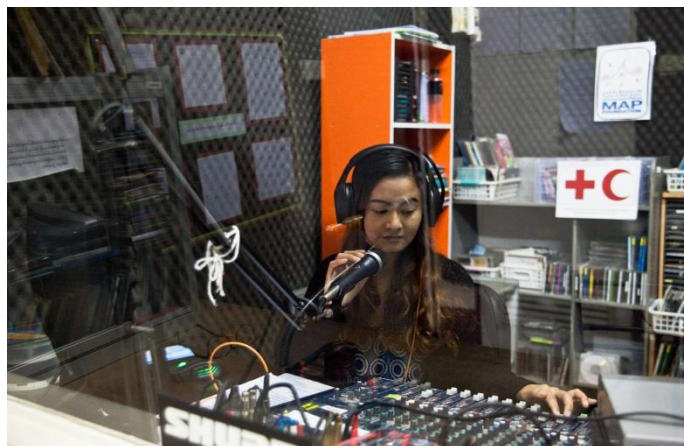
With support from IFRC, MAP Foundation and TLSDF run callin radio shows for Shan migrants. Since March 2016, more than 230 people called in for advice and assistance related to rights to rest days and leave, unpaid wages and employment contracts, health checks as well as travel restrictions and road accidents.

Through partnership with DEVCO, IFRC Bangkok in cooperation with four civil society organizations implements a number of interventions aimed at equipping migrant communities with the tools and knowledge to promote their empowerment, equal participation and integration into host society