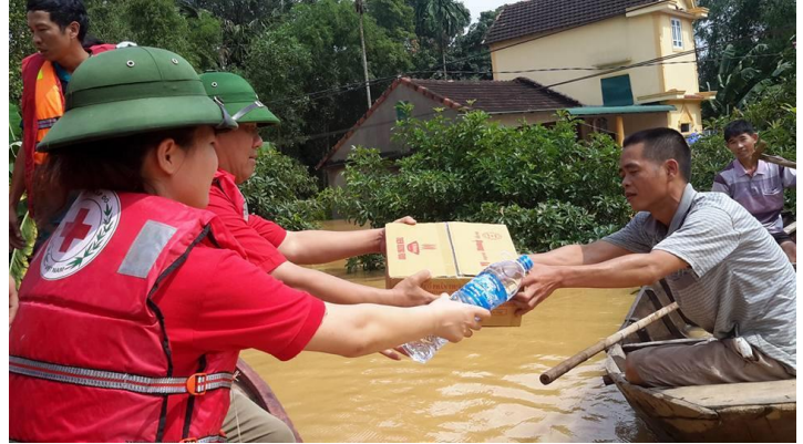
Ha Tinh Red Cross Chapter staff provided relief goods to families affected by the flood in Phuong My, Huong Khe, Ha Tinh. (16 October 2016)

Heavy flooding, as consequence of cold weather and torrential rainfall following Tropical Depression Aere, caused substantial damage in the central provinces of Nghe An, Ha Tinh, Quang Binh, Quang Tri and Thua Thien Hue. The provinces experienced heavy rainfall between 13 and 15 October. As a result, transportation on the main national road from the North to the South was disrupted. Many schools were closed. Rain started to reduce in the evening of 15 October, allowing for floodwater to recede around one meter in Tuyen Hoa district, Quang Binh province. On 16 October, rainfall has almost stopped but many areas remained inaccessible. A day later, many families in Son Trach commune, Bo Trach district, returned their homes and started cleaning.