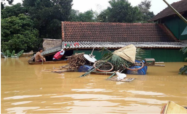
Water rose to rooftop in Phuong My commune, Huong Khe, Ha Tinh. (16 October 2016)