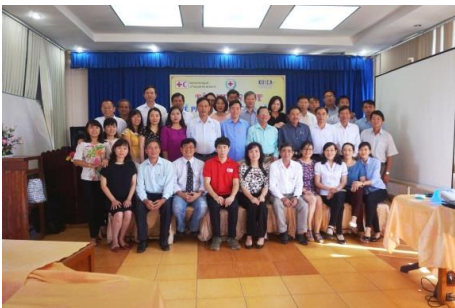
Training participants group photo