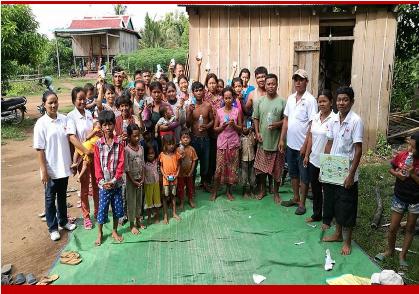
Global Hand Washing day on 15 October was celebrated at Prek Tatheong village of Chitr Borei district with members of the community

Peer-to-peer learning is one of the key approaches for regional cooperation in Southeast Asia Red Cross Red Crescent Societies, which consist of: