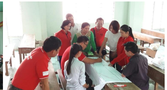
Community mapping the breeding sites of mosquitos

Viet Nam Red Cross (VNRC) conducted a Training on Community Health Preparedness of Zika and Dengue on 19-21 Oct 2016 in Ben Tre Province. 34 participants from 24 high-risk districts and communes took part in this training. It is expected that the participants are equipped with the knowledge and skills in taking preparedness action in response to the spread of Zika virus and mosquito borne diseases. The training was one among many initiatives supported by KOICA funded project which has been implemented by VNRC since 2015 in ten provinces throughout the country.