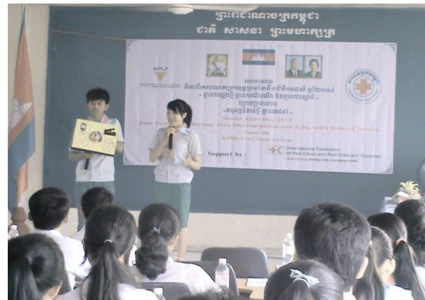
Siem Reap Youth in dissemination on HIV/AIDS on World AIDS Day

This flame has kindled to Singapore and Singapore RC also initiated YABC training and those trained youths organized Peer to Peer Symposium by mobilizing 300 Singapore youths and other SEA Youths. They have been successful in engaging Singapore youths into Community Led Action for Resilience for Elderly (CLARE) project starting from 2015. Singapore NS Leadership encouraged and supported to host the 2 nd SEAYN meeting in Singapore after Beijing Youth Summit by consolidating all 11 youth leaders into one, for promoting youth on move, doing better, doing more and reaching further.