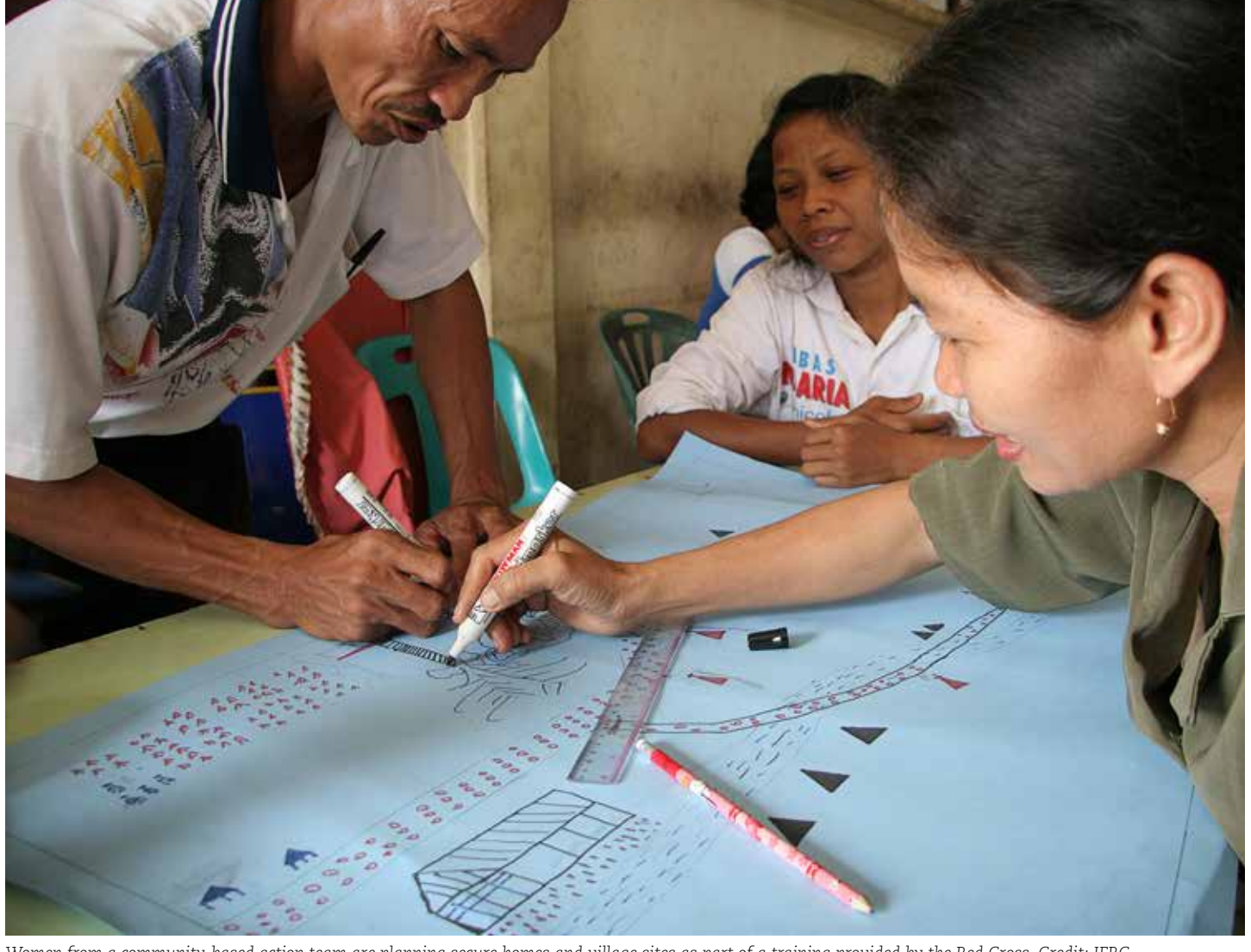
Women from a community-based action team are planning secure homes and village sites as part of a training provided by the Red Cross.

The toolkit has been tailored to build the capacity of staff and volunteers of National Societies, as well as the International Federation of the Red Cross and Red Crescent Societies at all levels of the movement. It has also been predominantly developed for National Societies within Southeast Asia with tools gathered from the region as well as globally. The toolkit framework will be available in nine regional languages of Southeast Asia making it more easily accessible for users in the region. It will also be available in English and therefore will be available to members of National Societies globally, as well as individuals and organisations external to the Red Cross Red Crescent Movement.