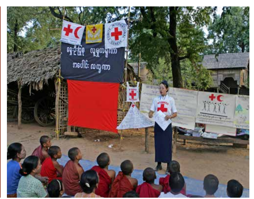
Myanmar Red Cross Society holds a two-week Community-based First Aid Training for Trainers