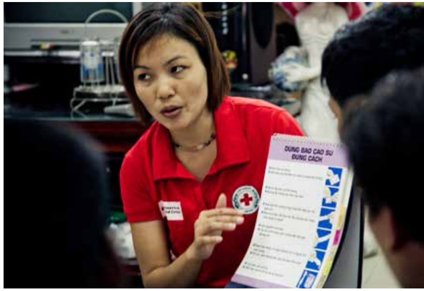
The support group "positive living group" is providing group counselling sessions on HIV

The approach of the International Federation of the Red Cross Red Crescent's South-East Asia Regional Delegation is in line with the IFRC's Strategic Framework on Gender and Diversity issues (2013-2020) as well as the Dignity, Access, Participation and Safety (DAPS) Framework outlined in IFRC's Minimum Standard Commitments to Emergency Programming.