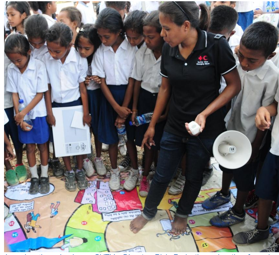
Learning through play - CVTL's Disaster Risk Reduction education for school children