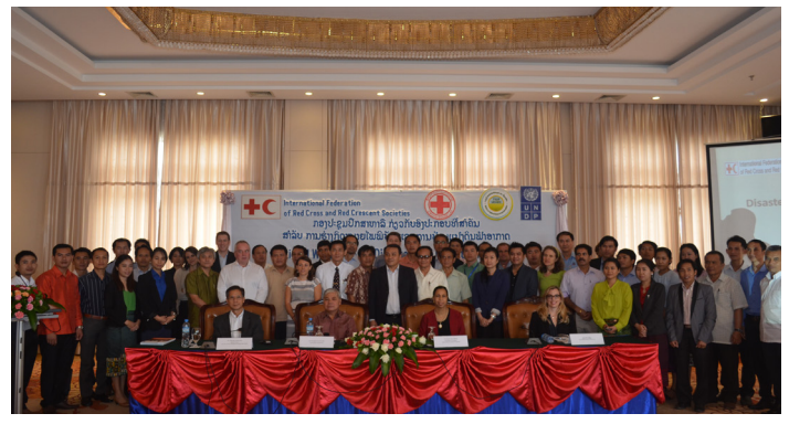
Lao Red Cross, IFRC, UNDP and the Ministry of Natural Resources and the Environment (MoNRE) held a workshop in Vientiane on the new Disaster and Climate Change Law, currently being developed in Lao PDR (July 2015).