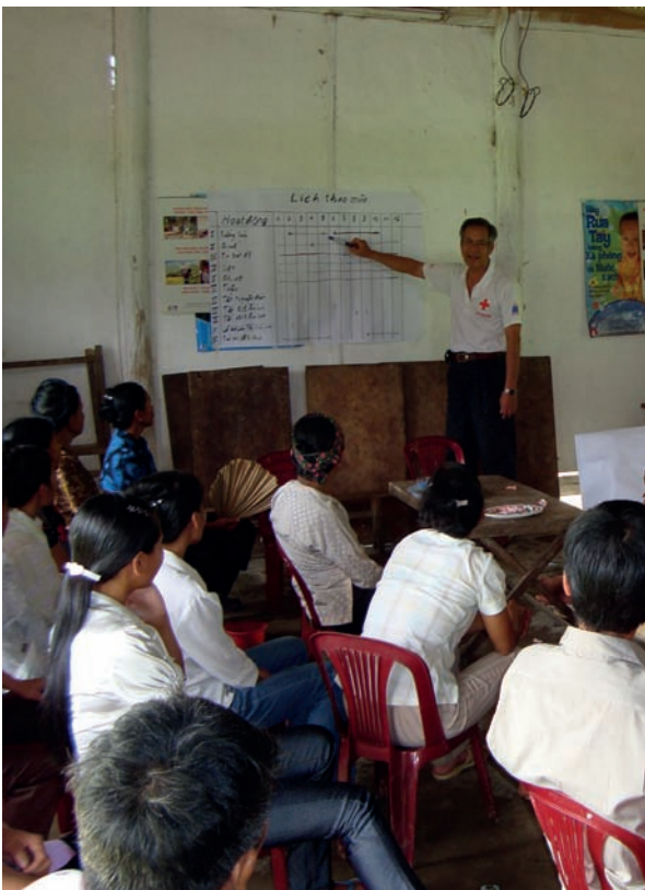
Community people should be in driving seat for the whole process - VIETNAM RED CROSS

After all things above are prepared and in place, you are ready to start VCA days in a community where step 7, 8 & 9 in Level 2 and step 10, 11 & 12 Level 3 would be addressed.