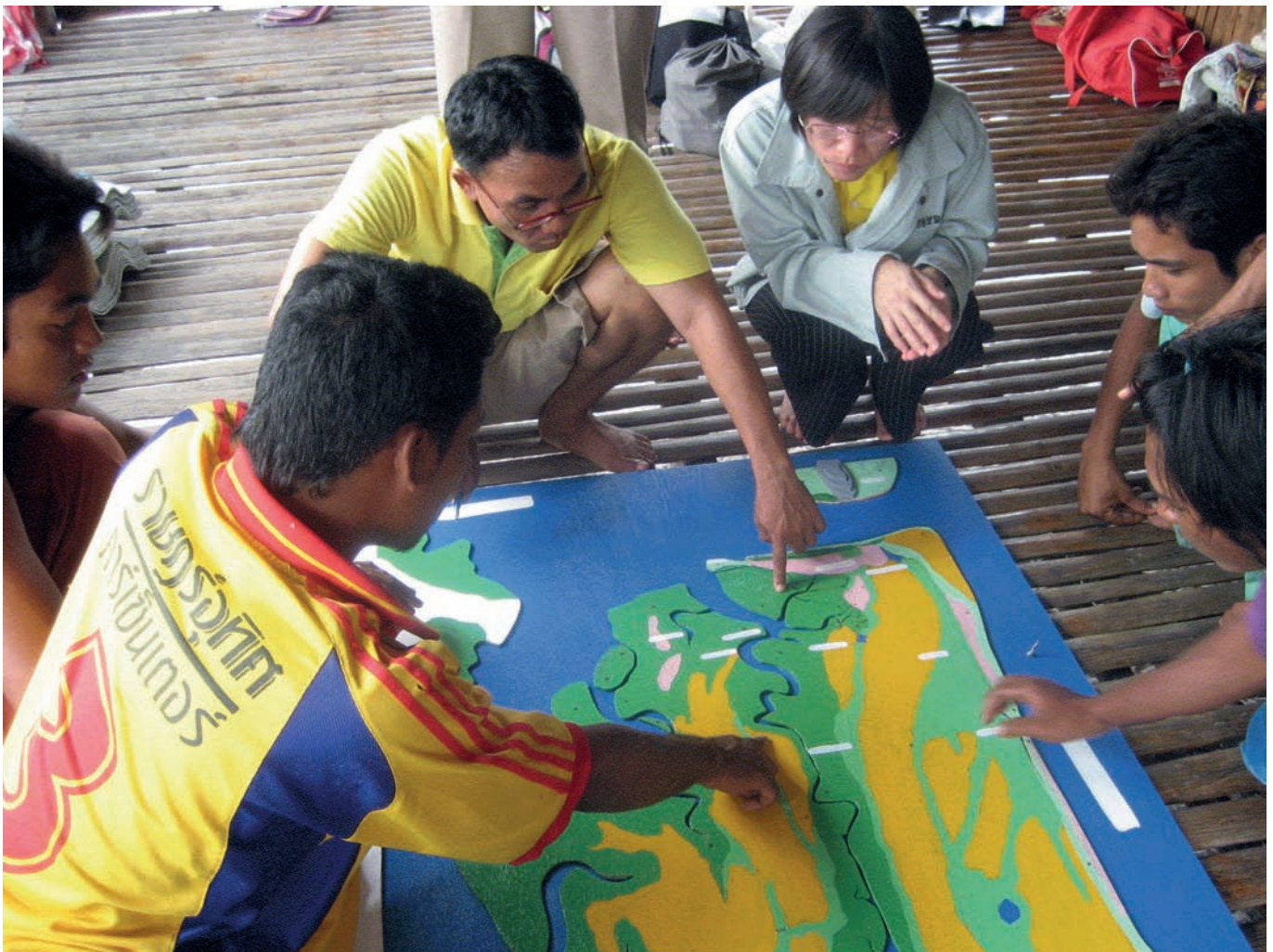
Risk analysis through mapping - THE THAI RED CROSS