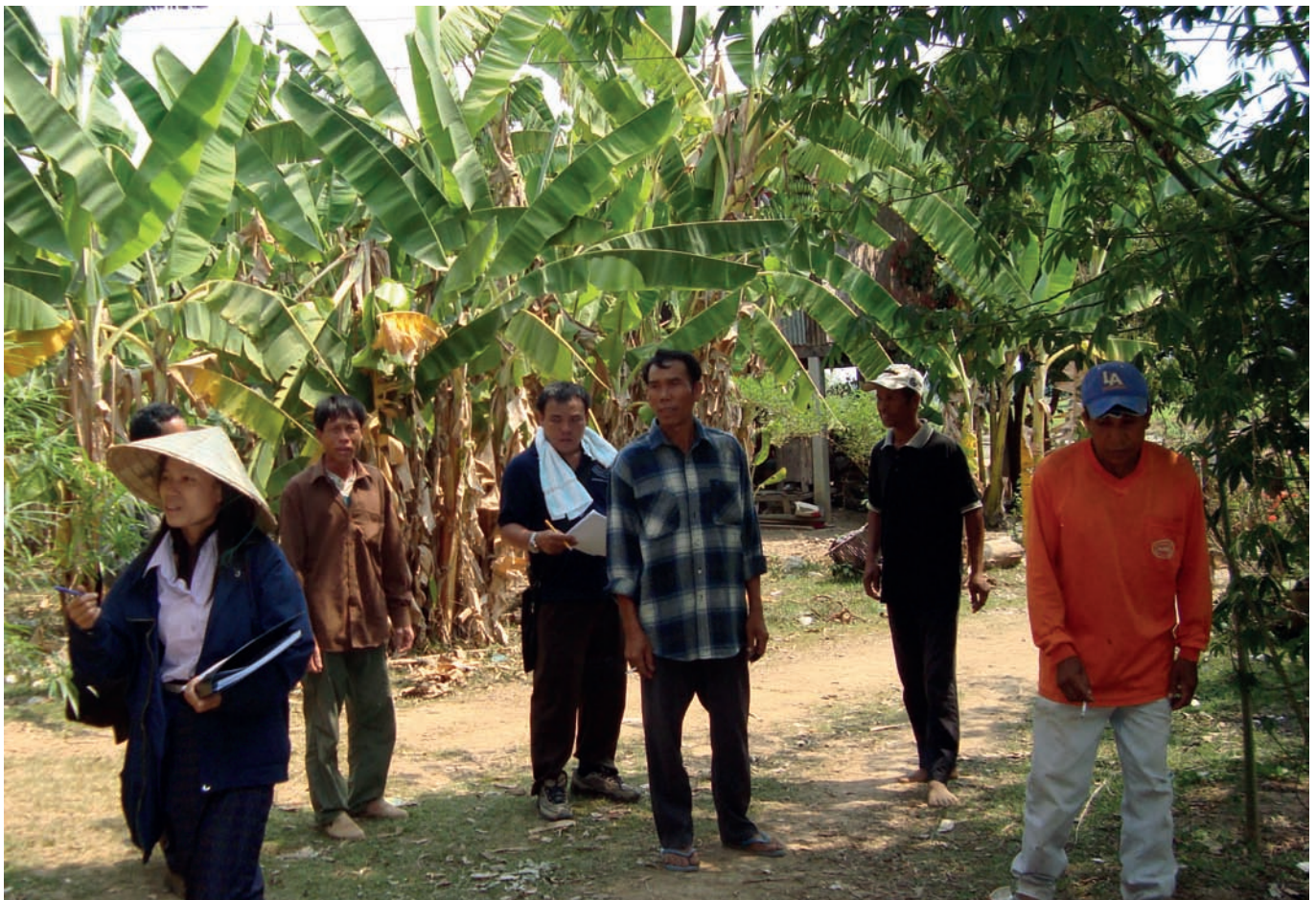
Direct observation is essential and integral during the course of VCA - LAO RED CROSS

Make sure key informants understand that the final draft charts with their inputs will be presented during the community meeting on day three.