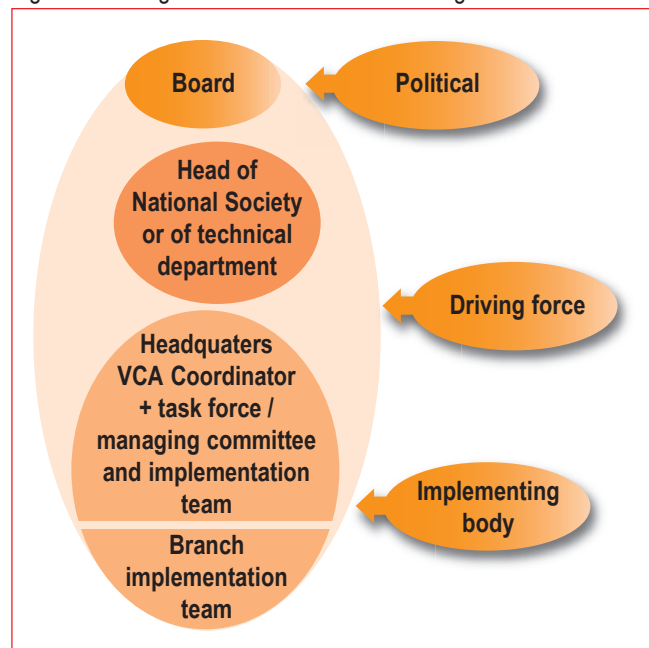
Figure 1: Management structure for conducting VCA