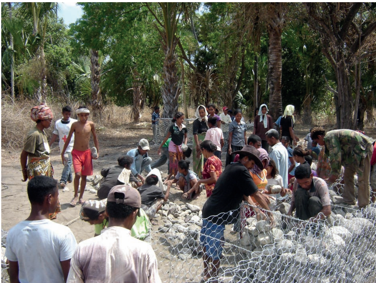
Red Cross volunteers assist communities in building "Stone Dragons" to protect river bank from eroding