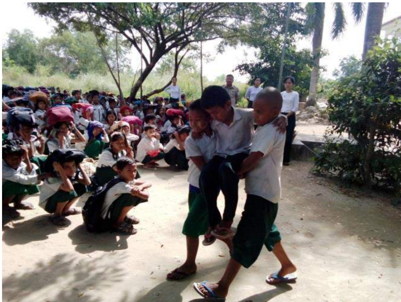
School drill exercise as part of School-Based Risk Reduction conducted in Myanmar

Peer-to-peer learning is one of the key approaches for regional cooperation in South-East Asia Red Cross Red Crescent Societies, which consist of: