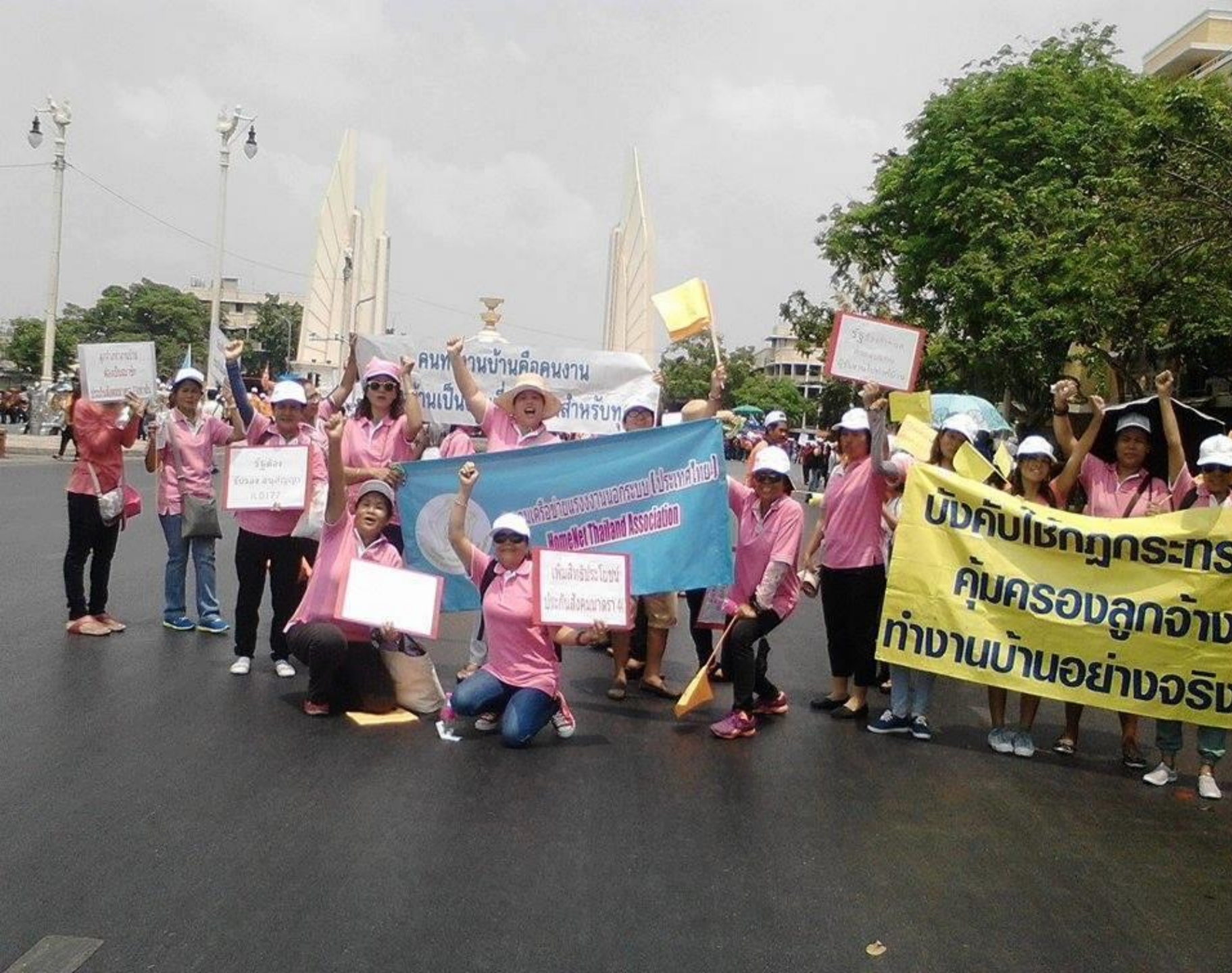
Activities on May Day (2016)