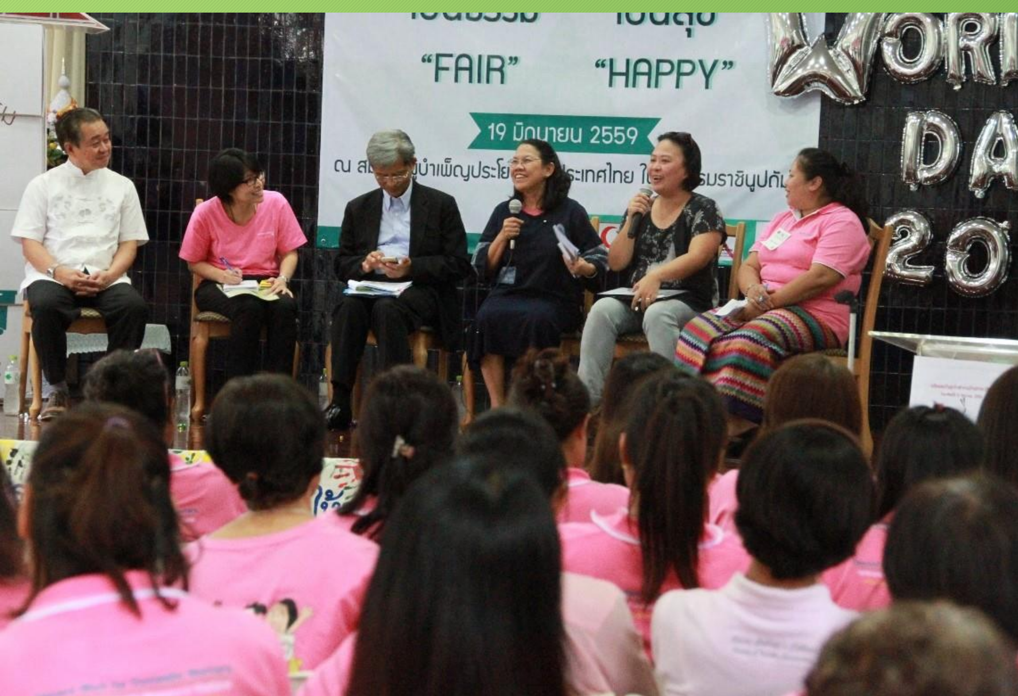
Panel discussion on how to look after Domestic workers