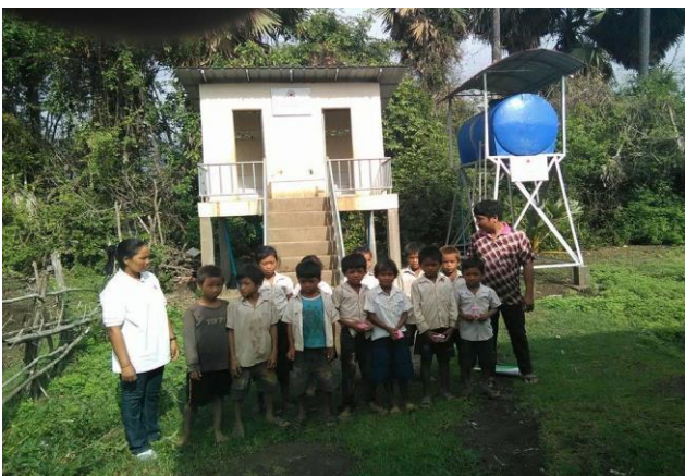
Cambodian Red Cross Kratie branch conducting awareness raising session in a Boseleav village school