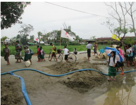
Elevating the ground for fencing the pond

Myanmar Red Cross Society is working together with 8 schools for mitigation activities such as: installation of clean drinking water storage tank, installation of water purification machine, elevating the flooded area in schools campus, construction schools latrine, construction the fencing of dangerous pond area and improvement of schools road access. Two schools have completed the construction of fencing for dangerous pond in school campus and improvement of school road access.