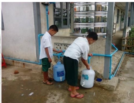
Water purification machine installation is completed and operational