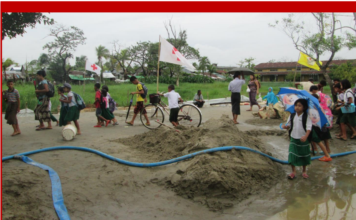
Myanmar Red Cross Society elevated the ground for fencing of a pond as a mitigation activity in school based risk reduction

Peer-to-peer learning is one of the key approaches for regional cooperation in Southeast Asia Red Cross Red Crescent Societies, which consist of: