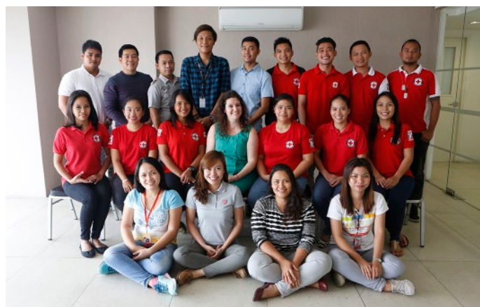
The PRC livelihoods team