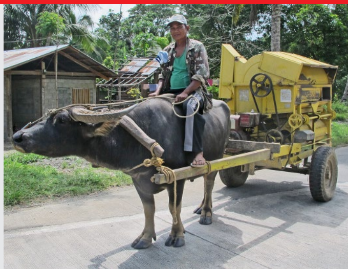
Filipino farmers' reliable best friend, a carabao (water buffalo)

The aim of the training was to help the group of very committed PRC staff to better understand animal welfare and enable them to work more effectively with animal owners, resulting