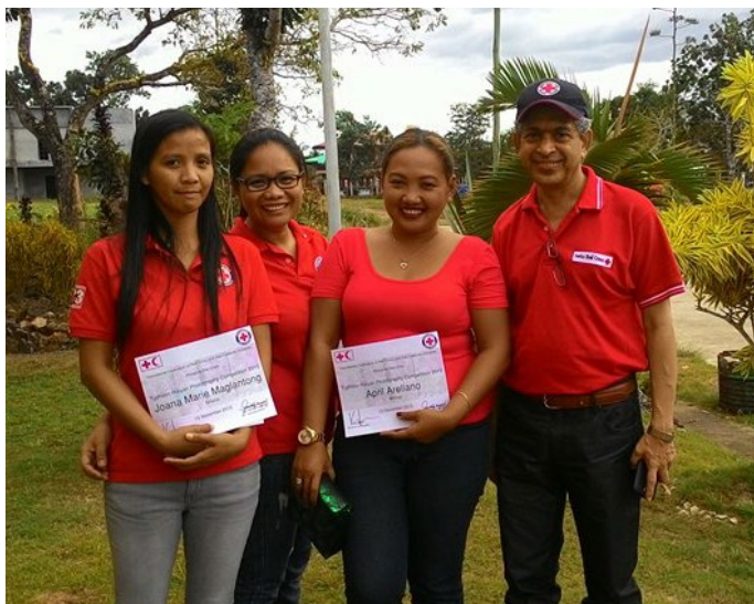
Coron prize winners receive certificates from PRC and Swiss Red Cross

'Next is the impact. Does the photo tug at your heart? There should be a connection between the subject, photographer and the audience. Then I look for its technical and compositional qualities.'