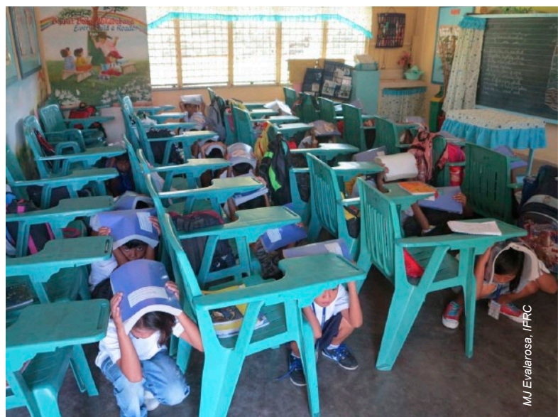
Unannounced earthquake drill at Nalsian-Bacayao elementary school. The school conducts regular drills every month based on SBDRR plan

The delegation also visited two schools in urban Manila to get an idea of the contrast with the two Pangasinan schools.