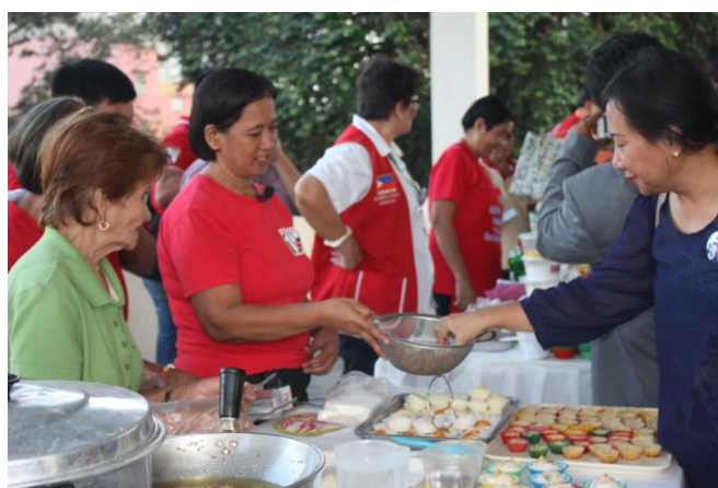
Participants during their field visit to a Philippine Red Cross livelihoods program, which engages local women to increase their income generation activities