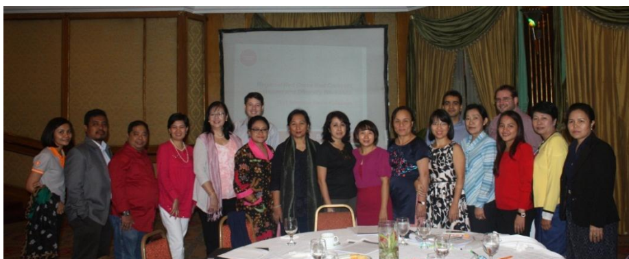
Group photo of all the participants after the successful completion of the First Annual SEA Regional Gender and Diversity Network Forum

Within Southeast Asia, as in many parts of the world, inequalities based on gender, sexuality, disability, age and ethnicity remain a great challenge. Discrimination and variable levels of access to resources continue to negatively impact human development, health, economic growth and individuals' and communities' ability to prepare for, and respond to, disasters. To address these issues, Southeast Asia's National Societies have been actively working to ensure their initiatives promote gender equality, respect for diversity and are non-discriminatory towards women, girls, boys and men. In the spirit of collaboration, IFRC and National Societies have been working together to increase co-ordination and to align their strategic direction. Together, they have been building their collective knowledge and capacity and integrating gender and diversity considerations into their programs, policies and tools.