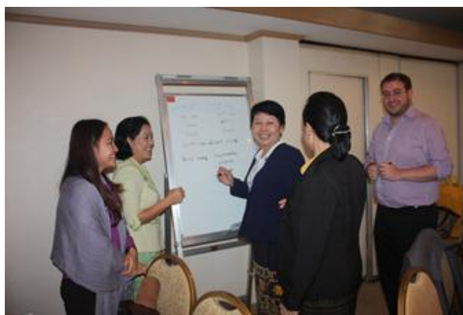
Participants discuss a number of issues during the workshop, including the concepts of gender and diversity

The group agreed to form a Southeast Asia Regional Gender and Diversity Network, pending formal sign off on the terms of reference. The Network will meet quarterly via teleconference and annually in a face-to-face forum.